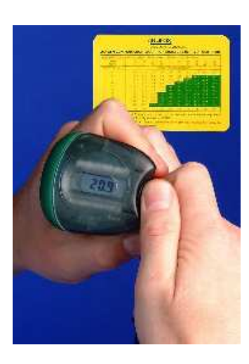
Calibration in clean air

The analyser is now ready for oxygen measurement.