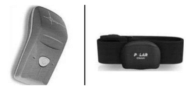
Figure 1. Device GPS SPI Elite® and Polar WearLink®.

This device weighs approximately 75 grams and can record (one record per second) time, position, speed, distance, height, direction and heart rate data (this one requires a thoracic band). The information can be downloaded in a PC and through AMS System software data can be manipulated according to researcher's interests. It enables a detailed and customized analysis of physical activity. Besides, data can be exported to Excel to perform the required statistical treatment.