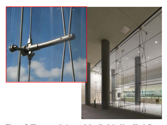
Figure 5. The general view and detail of the New York Presbyterian Hospital Milstein Heart Center [15].