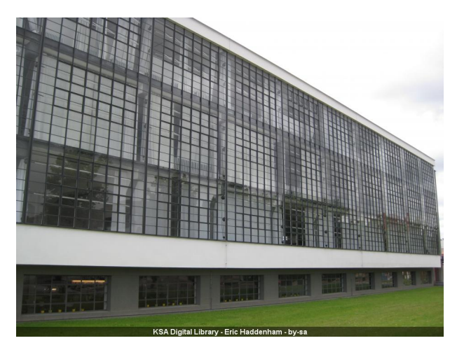
Figure 2. Glass curtain wall of the Bauhaus Dessau, 1926 [6].

The Serres were also to remain unchanged both in design and architectural function. The project architect, Adrien Fainsilber, defined the Serres as a transition space between the building and the park and wanted them to be as light and transparent as possible. The technical character of the Serres is architectural style called high-tech [1].