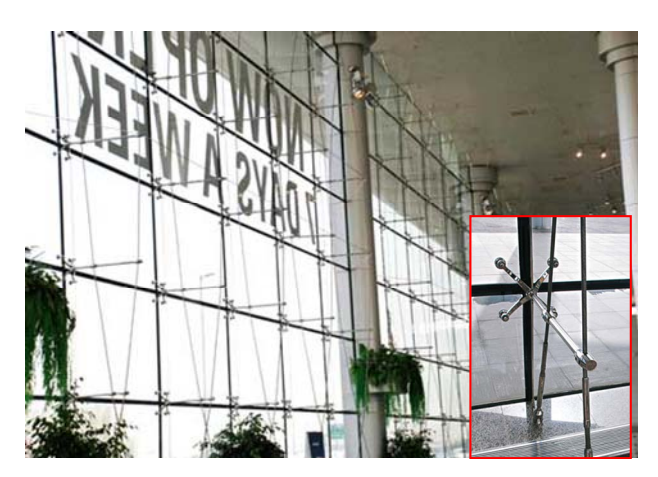
Figure 4. The general view and detail of the Toyota Show-room [14].

The curtain wall system was installed on the exterior façades. Curtain wall designs for the complex tower facade program were developed by Enclos to provide ample daylight and flexible, open laboratory spaces. Multiple story sky lobbies and split-level communal areas feature clear glass facades with sprawling views of downtown Boston. Cable truss supported glass walls wrap the entire 4-story lobby and conference area at street level. The cable truss system is comprised of a series of regularly spaced pre-stressed vertical cable trusses at five feet