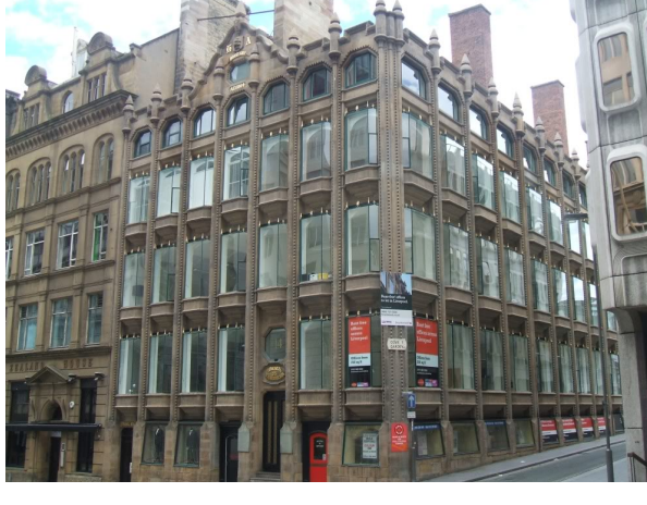
Figure 1. Oriel Chambers, Liverpool, England, 1864 [4].

Curtain walls can be classified by their methods of fabrication and installation into the following general categories: stick systems and unitized (modular) systems. In the stick system, the curtain wall frame (mullions) and glass or opaque panels are installed and connected together piece by piece [7]. Unitized curtain wall is an exterior façade system for high-grade buildings that matches the current international trend. With the integrated advantages of factory assembly, highly standardized technologies and greatly shortening construction period, it has been the most popular curtain wall with the most developing advantages in the field of curtain walls [8].