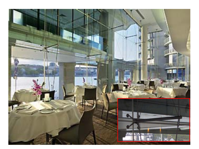
Figure 3. The general view and detail of the Quay Grand Circular Key [12,13].

This hospital addition, inserted between two existing hospital buildings, is enclosed by a four-story doubleskin glass façade adjacent to a four-story-high atrium with point-supported glass walls and a skylight. Glass floor bridges connect it to the existing buildings on its three upper levels. Each of the addition's two entries employs its own glazing system: captured insulating glass units and an austere glass canopy mark the 165th Street entrance, while visitors entering at Fort Washington Street pass through an all-glass vestibule backed by a