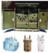
ABB Central Moloney Cooper Power Systems Delta Star Powell Esco R.E. Uptegraff Vantran Virginia