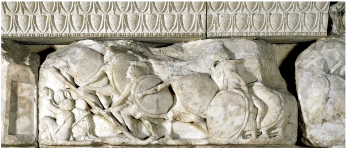
Relief from the Nereid Tomb showing warriors storming a city Lycia, Turkey 390-380 BC