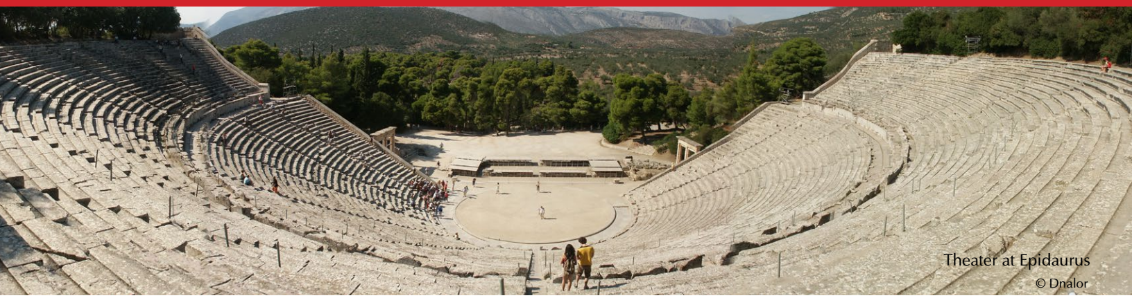
Theater at Epidaurus

acquired its name because King Aegeus of Athens leaped off this cliff to his death when his heroic son, Theseus, upon his return from killing the Minotaur, forgot to change his ship's black sail to white to indicate that he was alive. We return to Athens and enjoy dinner at leisure. (B,L)