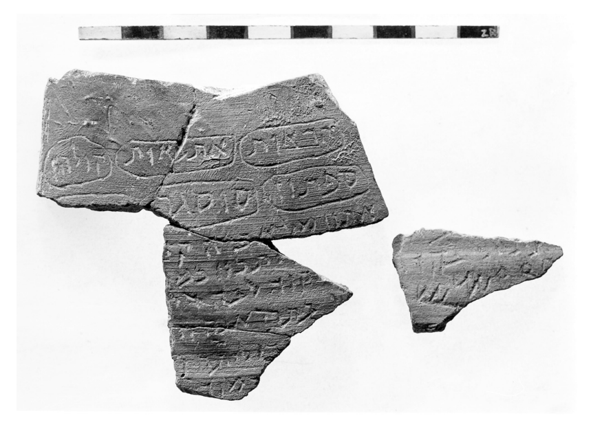
Figure 3.3 Clay sherds from Horvat Rimmon, with an erotic spell, incised on wet clay which was then thrown into a fire (the right-hand fragment belongs below the other four, at some distance). Recipes for the production of this specific spell have been continuously transmitted from late antiquity to the twentieth century. Note the charactères , and the "cartouches" surrounding the angel-names (lines 1–2).

letter.<sup>30</sup> Such parallels also aid in reconstructing the entire ritual which these fragments represent, in which the erotic spell was inscribed on a piece of unbaked clay which was then burned in a fire or kiln. The sympathetic nature of the ritual is made explicit by the adjuration itself, "just as this sherd burns, so will the heart of NN" – whose name, of course, cannot be reconstructed from the Genizah recipes which parallel this "finished product" – burn in love or desire for the client who ordered this ritual, and whose name too is irretrievably lost. And here, too, we must note how a peculiar feature of our ritual – that the text was incised upon wet clay and then fired, rather than being written upon a potsherd (or a piece of papyrus, vellum, or cloth) with ink, inadvertently assured its preservation and facilitated its identification as a magical text. And given the enormous popularity of this recipe, which is continuously documented for a millennium and a half, it