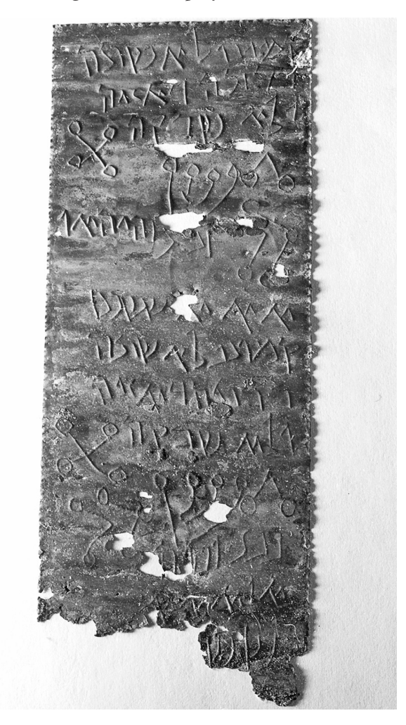
Figure 3.1 A bronze amulet, found in Sepphoris. The Aramaic text and the charactêres are written twice (lines 1–6, 7–12), and as no client name is mentioned in this generic amulet against fever, it may have been "mass produced" in advance. The amulet was photographed from the back, with the photograph flipped over horizontally.

graves (presumably those of their owners), in private homes, or in public spaces; in one case, a cache of amulets was found inside a synagogue – an intriguing find to which we shall return in Chapter 5.<sup>18</sup>