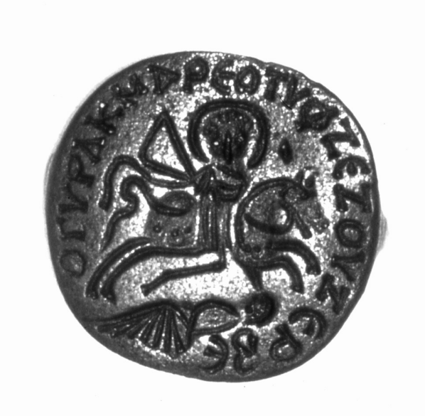
Figure 3.5 A bronze amuletic ring, showing a holy rider spearing a prostate female demon. The Greek inscription surrounding consists solely of "magic words," but the exact same formula appears in some Aramaic and Hebrew magical texts. This amulet is either Christian or Jewish.

sense whatsoever, but when read from left to right (or, in the English transliteration, from right to left), it yields some sense – the first line is "Michael," the third is "Israel," and the other two probably contain angel names, such as Raphael, and perhaps even Azazel or Azael.<sup>47</sup> While the authenticity of this gem is far from certain, it is at least possible that a Jew-ish magician created the basic design, which a non-Jewish gem-cutter then produced, but incised the letters in reverse order. It also is quite possible that the inscription was deliberately written in a retrograde manner, as this mode of writing is well attested in ancient (Jewish and non-Jewish) magic.<sup>48</sup>