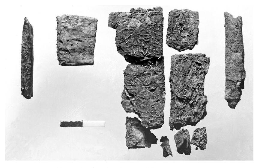
Figure 3.2 Five of the amulets found in the apse of the synagogue at Horvat Ma'on (near the modern Kibbuz Nirim). Note that one has been folded, while the rest have been rolled.

Examining the amulets' actual contents, we may note that virtually all of them were made for what might broadly be called "medical purposes" – either to exorcize demons which were deemed to be afflicting a specific patient, or to prevent any harm from such demons and from the evil eye. The means for securing these goals usually consisted of the adjuration of these malevolent powers to exit the patient's body, or not to enter it at all, and the use of powerful words, signs, and designs, all of which will be discussed in greater detail in the next two chapters. In many cases, it seems clear that a certain amulet was produced from a written formulary, an issue to which we shall return below; some amulets, however, are so short and so simple that they may well have been manufactured from memory, or even on an ad hoc basis. Finally, we may note that while most amulets were made for specific individuals and in order to answer specific needs, some amulets clearly were prefabricated, with the client's name inserted only at the last moment, or without a client's name at all (i.e., a "generic" amulet).<sup>19</sup>