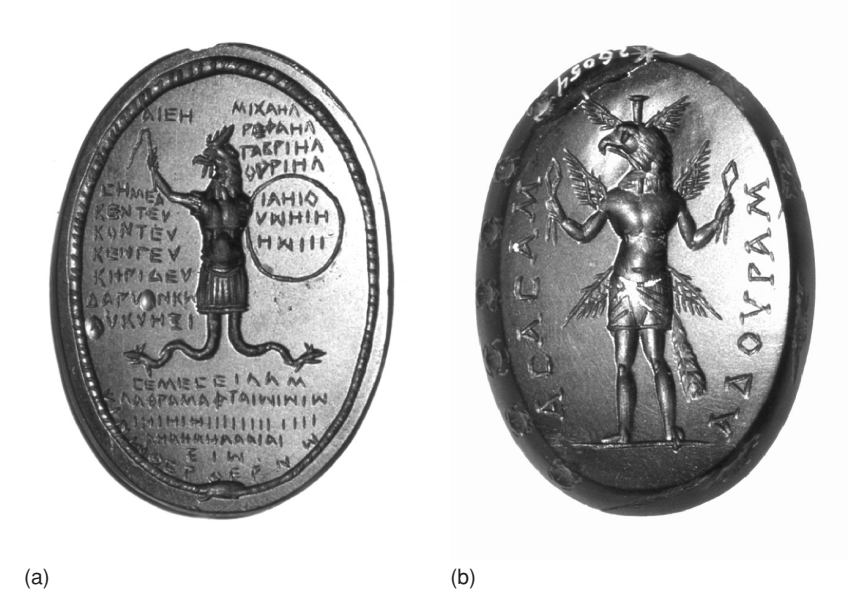
Figure 3.7 A Greco-Egyptian magical gem, showing, on the obverse, the cock-headed snake-legged god and numerous "magic words" (including, above the shield, Michaêl, Raphaêl, Gabriêl and Ouriêl, and, below the whip, the sêmea kenteu -formula), all surrounded by an ouroboros ; on the reverse, an eagle-headed deity with six wings.

harm a named individual or (very rarely) to make a named individual love another named individual. ^{\rm II8}