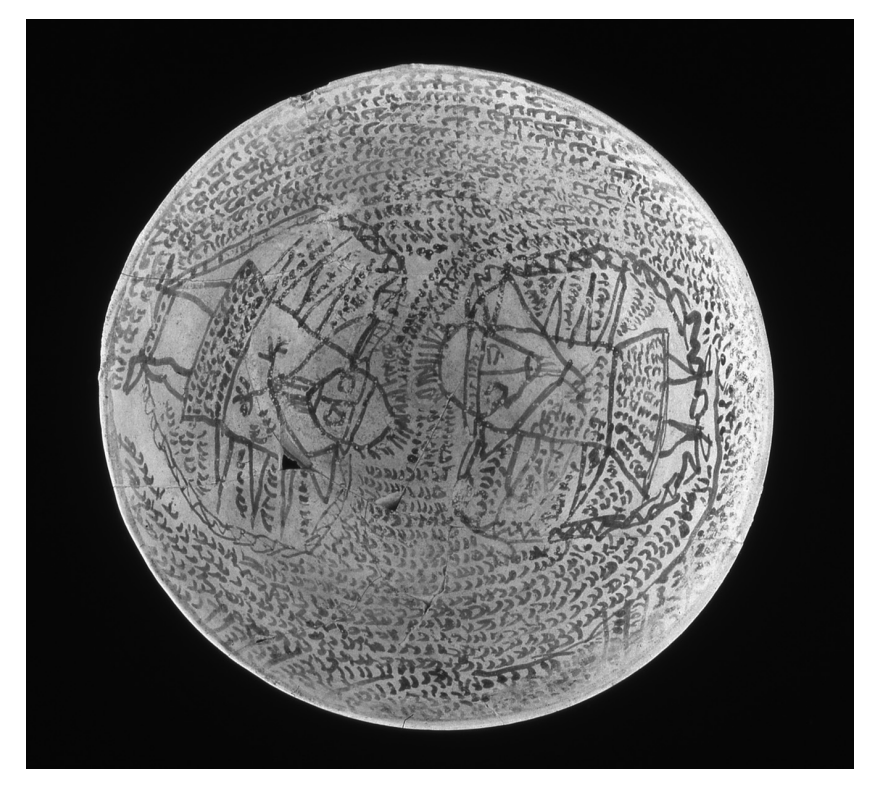
Figure 3.6 A Babylonian incantation bowl with the image of two bound male demons, surrounded by pseudo-alphabetic "squiggles." Note the demons' beards, their six wings and bound hands, and the shackles surrounding each demon.

for different ones – clearly points to the existence of professional local bowlwriters who worked from pre-set models.<sup>113</sup> Whether these models were transmitted orally or in writing is not entirely clear, but an examination of the "duplicate" bowls tends to argue in favor of a mostly oral transmission, as the differences between pairs of parallel bowl-spells do not seem to display the kinds of errors that stem from copying written Vorlagen , and as the producers seem to have used "blocks" of spells whose order they could change at will.<sup>114</sup> The corrupt citation of biblical verses on some of the bowls, which clearly is due to recitation from memory and not from a written