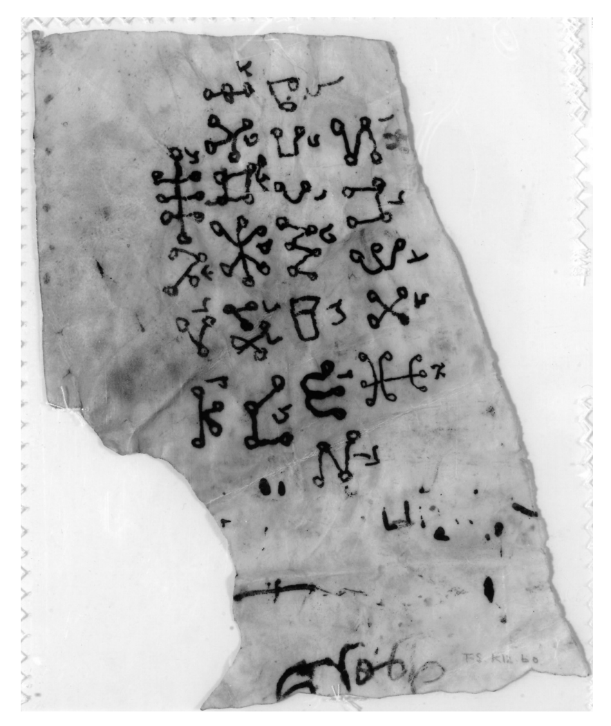
Figure 4.2 A Genizah fragment, written on a torn piece of used paper (the verso, not shown here, contains the remains of an Arabic documet), and showing an attempt to "decipher" the charactêres as letters of the Hebrew alphabet. Such attempts were extremely common in the Middle Ages, among Jews, Christians and Muslims alike.

even in such cases, the parallels must be noted, if only to prevent a purely "Jewish" interpretation of these symbols by modern scholars. Thus, to give just one example, when we find a "fish-bones" design on a late-antique silver amulet which contains some Hekhalot-type materials (discussed in