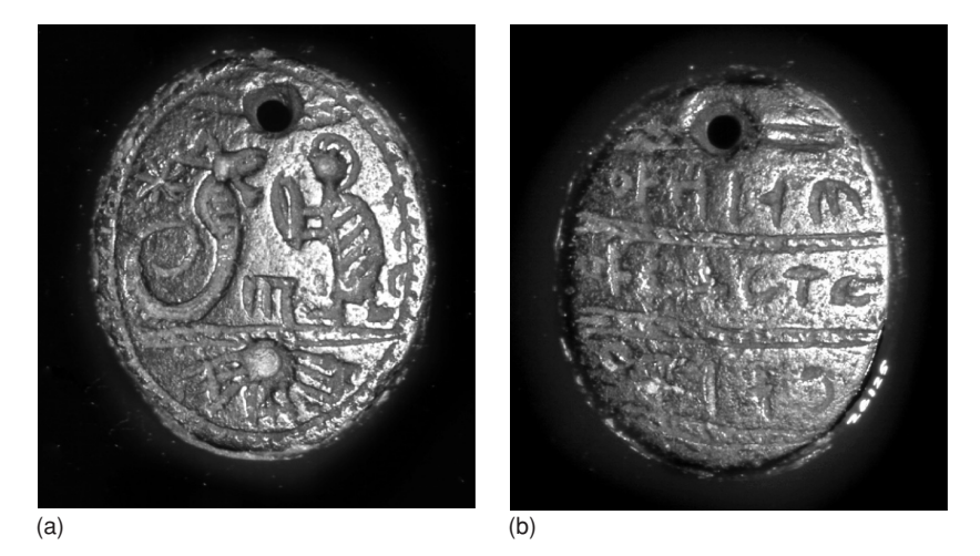
Figure 3.4 A magical gem, showing, on the obverse, Daniel feeding the Babylonian snake-god; on the reverse, a quasi-alphabetic inscription. This is one of a series of similar gems with scenes from the Hebrew Bible, the Apocrypha, and the New Testament, all probably produced by a Christian workshop in late-antique Syria.

angelic names, while the handful of magical gems which display this Jewish symbol sport none of the images which are so common on the pagan magical gems. Thus, even these few pieces highlight the gulf between the Jewish and the pagan magical gems, which shall become even more apparent below. On the other hand, there are several series of ancient magical gems which carry scenes based upon the biblical and apocryphal stories, and especially the binding of Isaac, Solomon mounted on a horse and spearing a prostrate female demon, Daniel in the lions' den, Daniel feeding the Babylonian snake-god (see Figure 3.4), or the maritime adventures of Jonah.<sup>37</sup> It seems, however, that all these gems stem from Christian workshops (which also produced gems with such scenes as the raising of Lazarus or Jesus and the twelve Apostles), and there is not even a single specimen that may securely be identified as Jewish.<sup>38</sup> This, however, is an issue to which we shall return below.