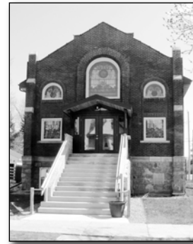
Lets insure the preservation of this wonderful building.