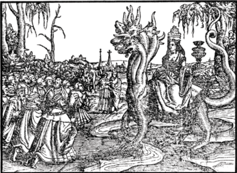
(From Luther's German Translation of 1534)

Luther maintained this was a prophecy about the antichrist Roman Church. To make this clear, even for those who were illiterate, Luther placed a woodcut (i.e., an image printed from a design cut in a block of wood) in his German translation of the Bible. Take a close look at the woman in the woodcut.