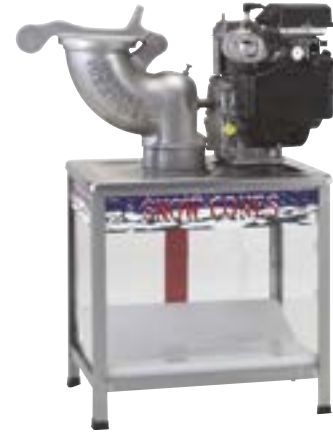
Gas Ice Shaver