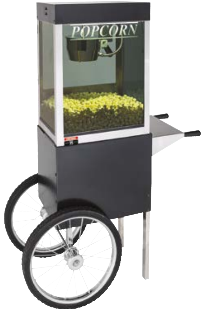
Black Two-Wheel Wagon