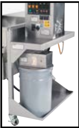
Oil Pump Caddy Shelf