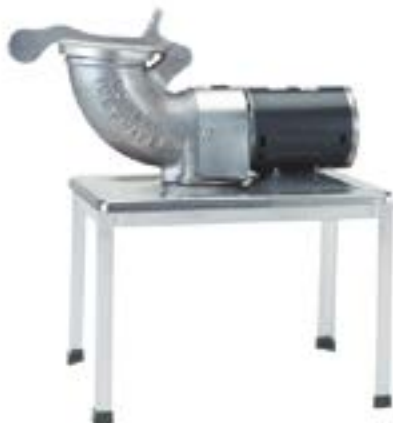
Open Counter Stand