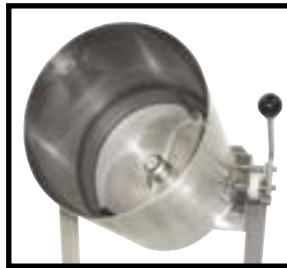
Double Feature Popping/Coating Blades