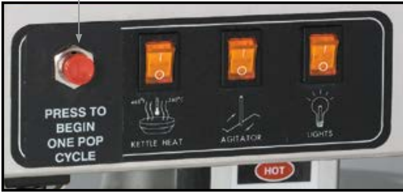
Patented One-Pop Option