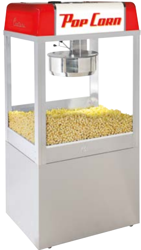
Mach 5 with Lighted Retro Plastic Top