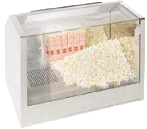
48" Counter Showcase Cornditioner