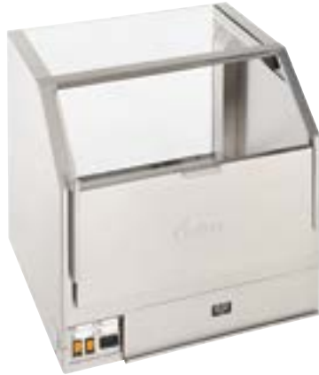
36" Counter Showcase Cornditioner