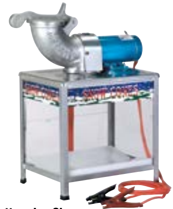
Battery Ice Shaver