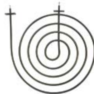
Pizza Oven Coils