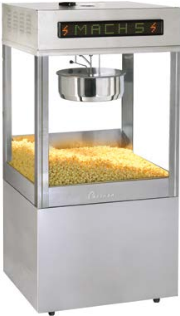
Mach 5 Floor Model (3 ft)

With more than 12 decades of concession experience, Cretors large concession poppers have evolved to become the top performers in the industry. Form, function and durability are constantly integrated into each new machine design and upgrade. Whether your popping style includes a suspended or a pedestal kettle design, Cretors has the design that best works for you.