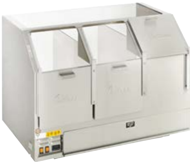
48" Counter Showcase Cornditioner with Three Doors