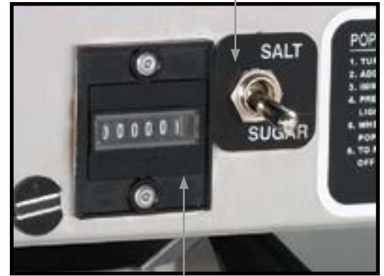
Patented One-Pop Counter Option