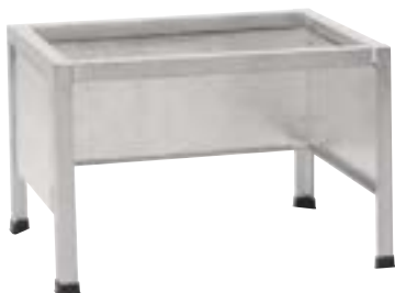
Paneled Counter Stand