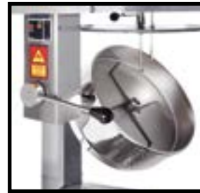
Mach 5 Kettle