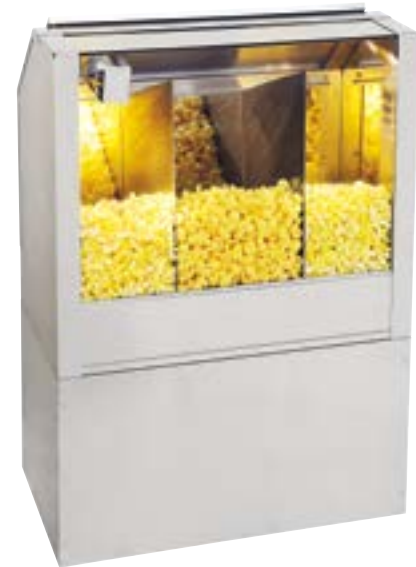
36" Counter Showcase Cornditioner (shallow depth)