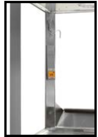
Popit N' Topit