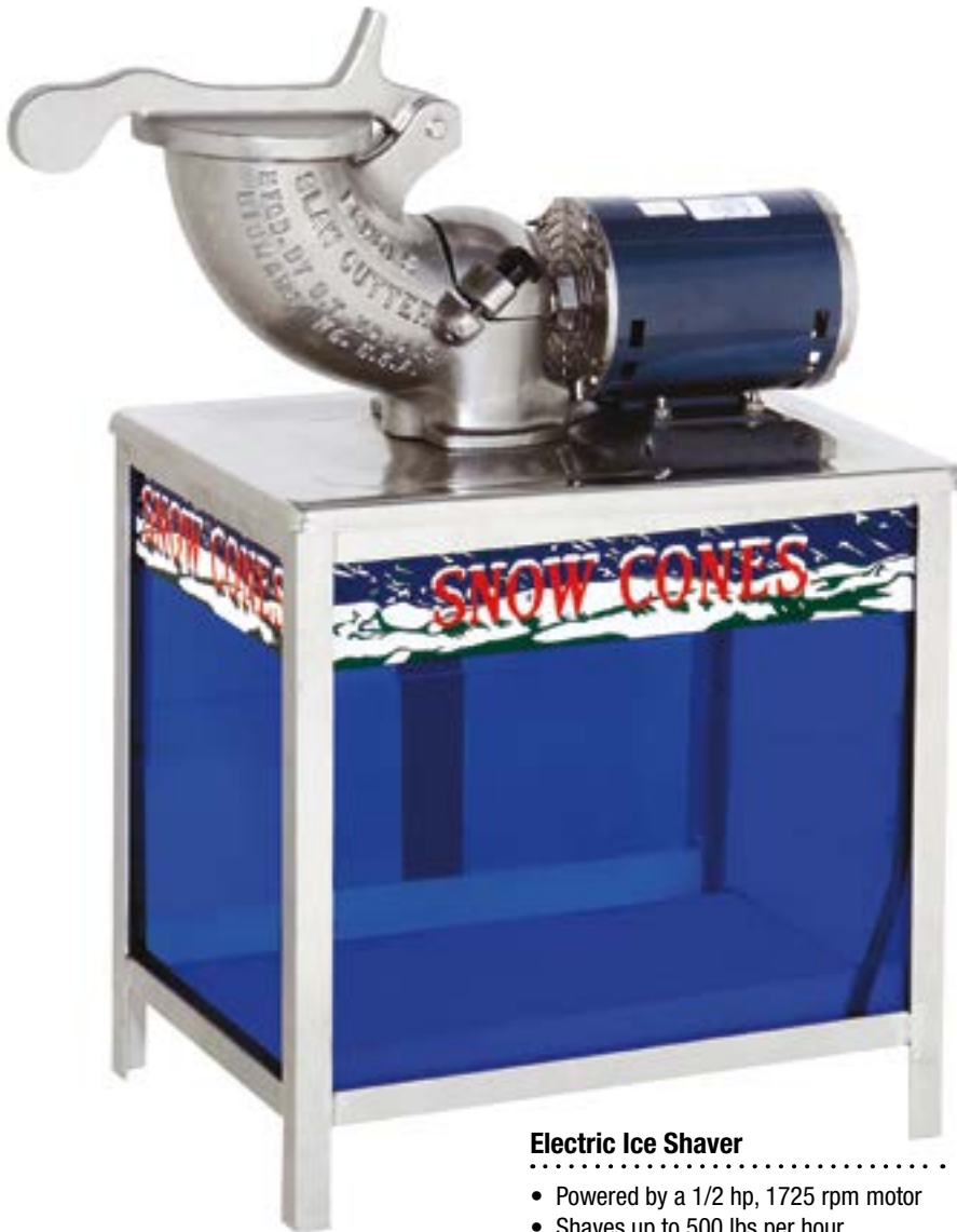
Electric Ice Shaver

Invented over 75 years ago by S.T. Echols, the Echols Ice Shaver has been the favored design in the concession industry. Just like Cretors, the Echols ice and food shavers combine innovative thinking and dependable design that allows users to shave ice easily and consistently. Constructed of heavy-duty cast aluminum, these machines have the power to handle heavy work loads day after day and their strong construction ensures years of service. These machines will accept any size ice cubes to chunks 4 1/2" in diameter.