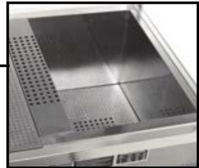
Bin Elevator (down)