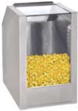
20" Counter Showcase Cornditioner