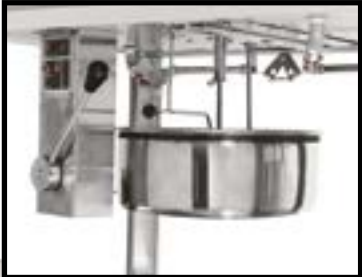
ANSUL Discharge Nozzles