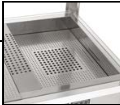
Bin Elevator (up)