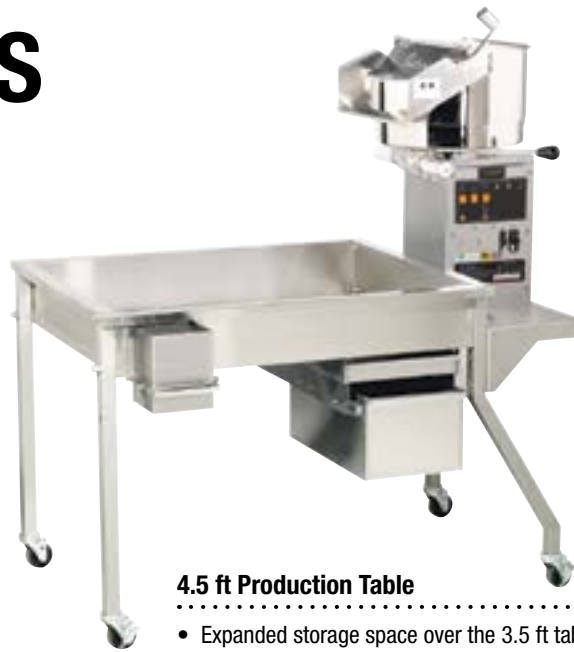
4.5 ft Production Table