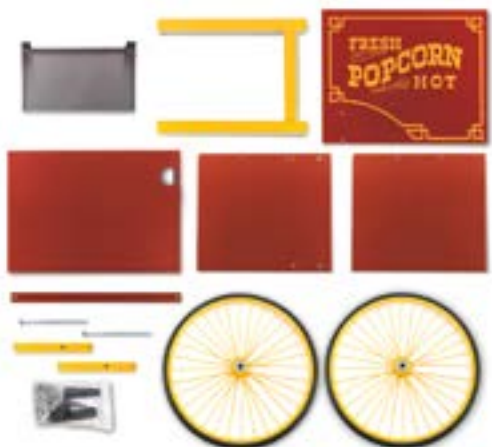
Knock Down Wagon