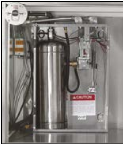
ANSUL canister inside base cabinet