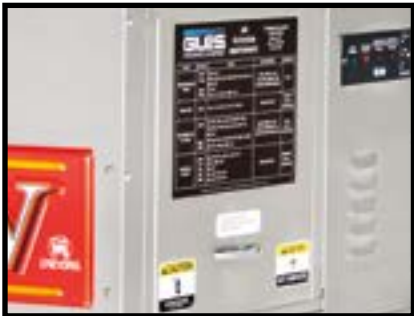
Close-up of Ventless Feature