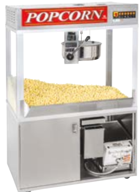
Mach 5 Floor Model (4 ft)