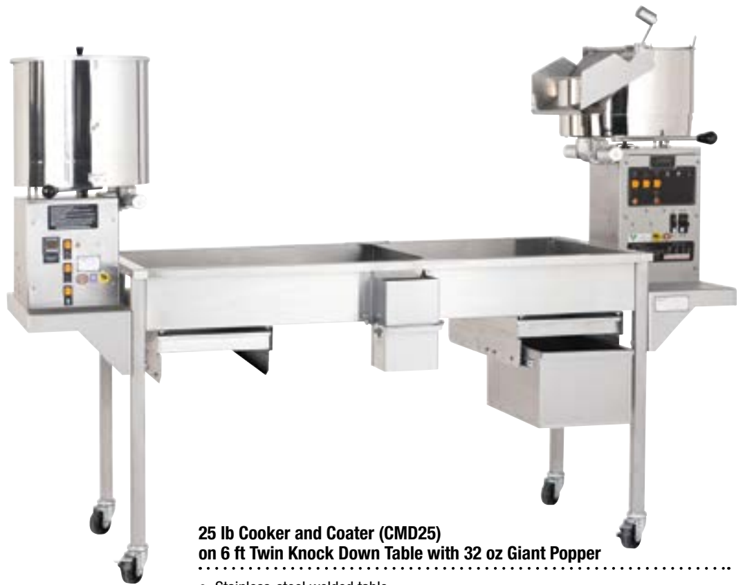
25 lb Cooker and Coater (CMD25) on 6 ft Twin Knock Down Table with 32 oz Giant Popper