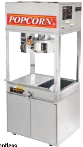
Mach 5 Ventless