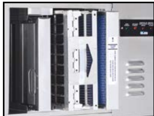
Ventless Hood System