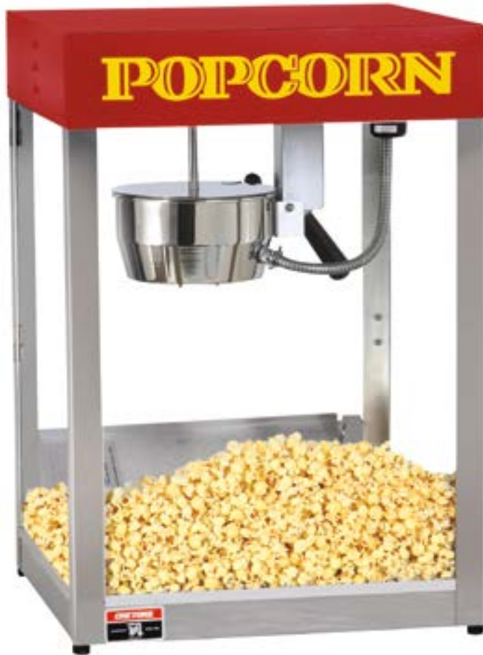
T-2000 Red Top

8 oz Poppers With a slightly larger cabinet and kettle size, the T-2000 produces 33% more popcorn per cycle than the Goldrush. The T-2000 is the perfect mid-range popper. Choose between a standard or antique-style cabinet.