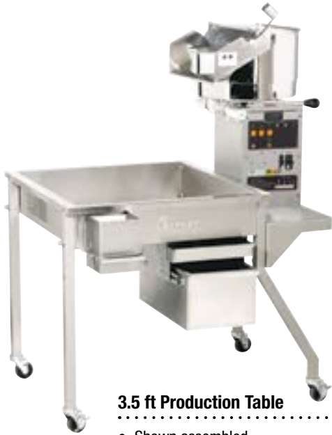
3.5 ft Production Table