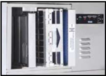
Ventless Filters • Baffle grease filter • Electrostatic filter • Polysorb filter