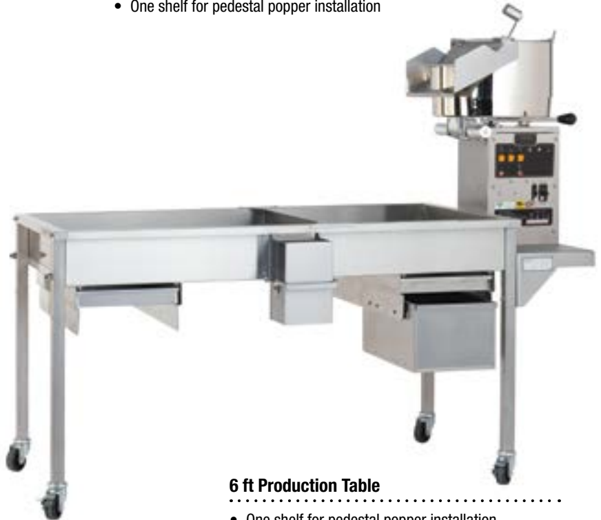
6 ft Production Table