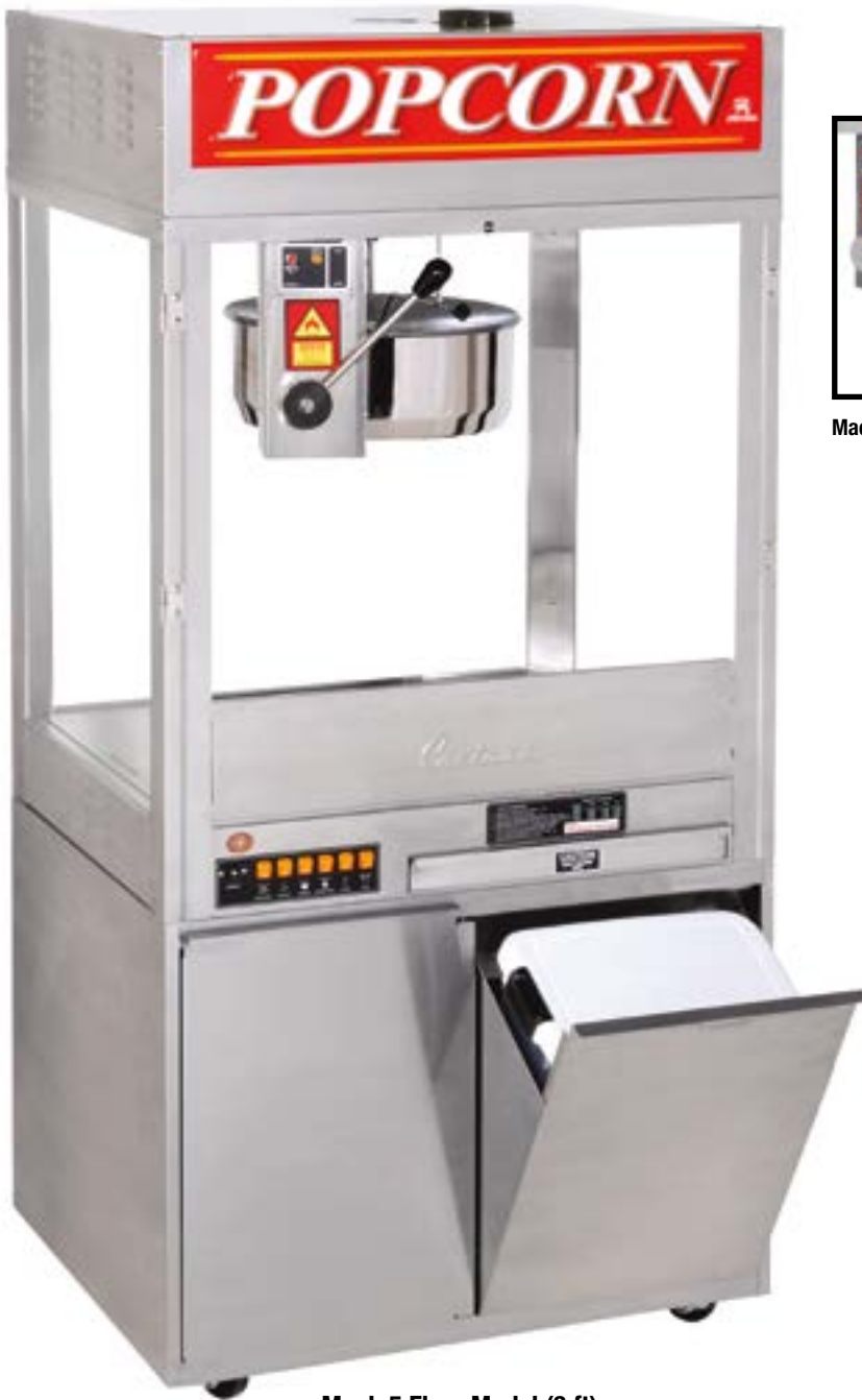
Mach 5 Floor Model (3 ft)