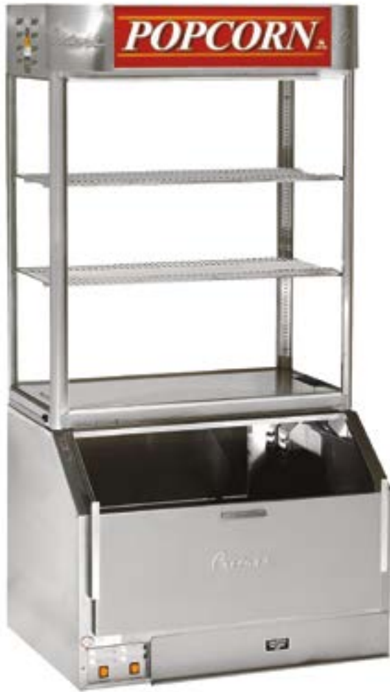
Combination Modular and Counter Showcase Cornditioner Cabinet (back view)