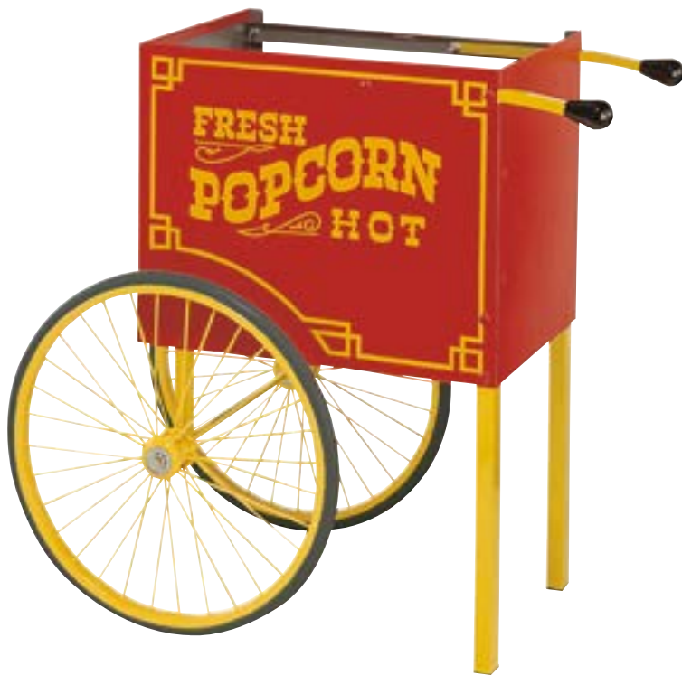
Knock Down Wagon (shown assembled)

Charmingly reminiscent of Cretors wagons and poppers from 100 years ago, you can combine one of our wagon bases with either the standard or antique small concession poppers. Not only do our bases increase versatility and mobility, when strategically placed, our poppers become easy to spot and work hard to increase sales. They're ideal for locations where the counter model popper is not practical or a small floor model or mobility is needed.