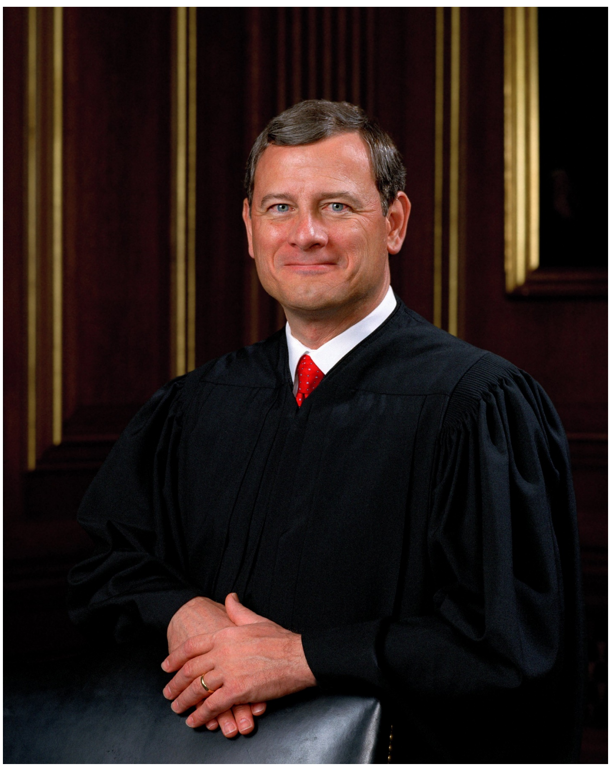
What job or political office is now held by (John Roberts/this person)? [TEXT BOX 40 CHARACTERS]