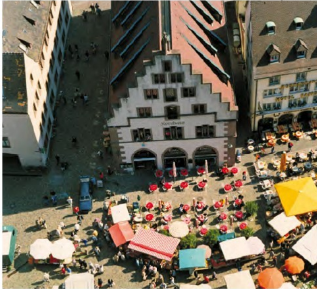
The Farmers Market on the main town square