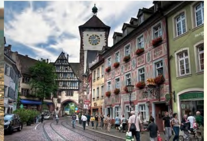
Our beautiful "Old Town"