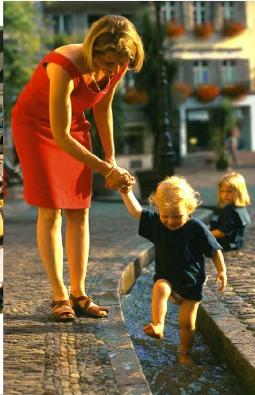
Freiburg's famous "Bächle" (street canals)