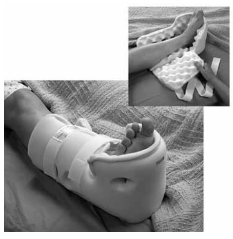
Convoluted Interior Shown