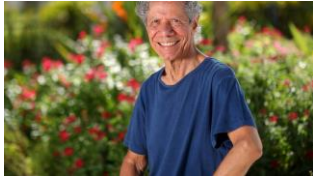
Chick Corea (79)