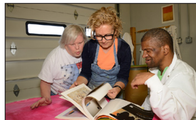
Funding in the budget will allow 3,500 new people to be served on the Family Supports Waiver over the next two years, providing access to supports and services, like The Arc of Greater Boone County's Arc Artisans program.

the biennium, along with transfers from CHOICE funds to the Aged and Disabled Medicaid Waiver of $18 million each year.