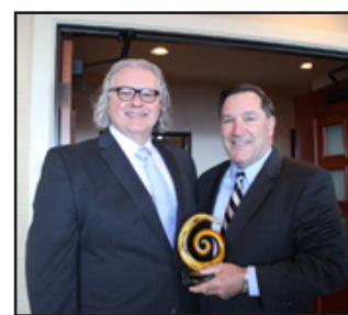
Senator Joe Donnelly