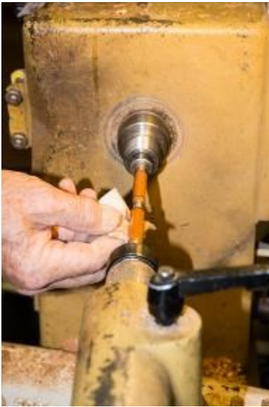
Finish Applied to Pen