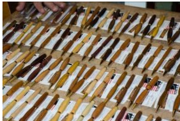
Some of the 170 Pens Made