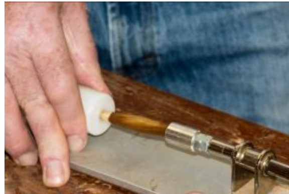
Pressing Hardware onto Pen