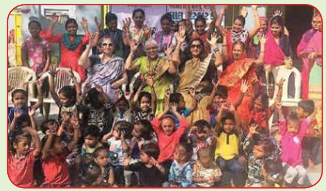
Street children project of Rajkot Branch