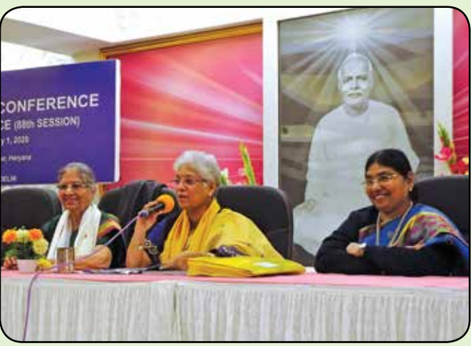
On the Dais