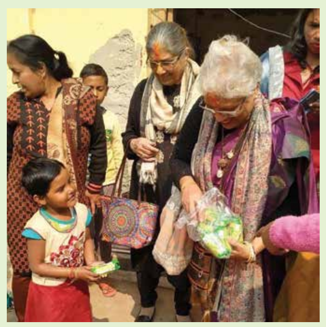
Distributing goodies to the children

The present Old Age Home is housed in rented premises, Tarash Mandir, and accommodates old women, and women who are there for a short stay accompanied by their children. All the residents gave a wholehearted welcome to the visiting members, reciprocated by President and Secretary General who distributed sweets among them.