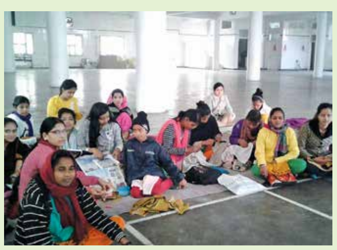
Tailoring Class in Pandav Nagar