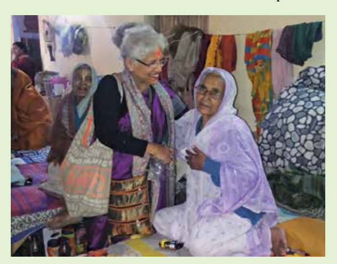
President with an elderly resident of the Home.

Office Bearers and the team then visited AIWC's plot of land at Mahavan, Mathura. This plot, measuring approx. 1000sq.yards has been donated by yet another generous member. A boundary wall on the plot has been constructed by AIWC. To further build upon the extensive groundwork undertaken so far and to ascertain the optimum