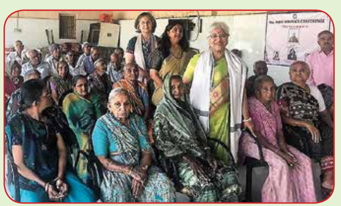
With senior citizens of the home