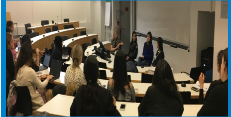
Women students engage with the panelists at the "Is the VI Program Right for Me" panel