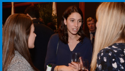
Alumni and friends exchange ideas at the 11th Annual Pershing Square Value Investing and Philanthropy Challenge