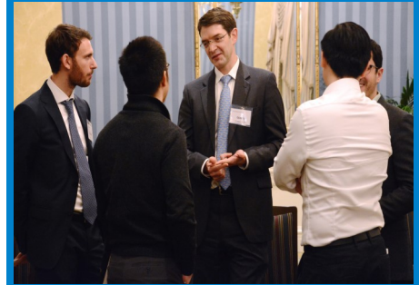
Alumni and students mingle at the Ben Graham Meets Technology reception