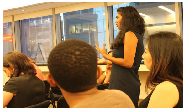
Guests ask questions to the panel at the 3rd Annual Women in Finance event