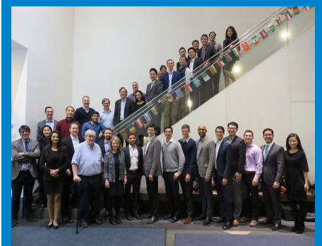
Value Investing Program Class of 2018

Congratulations to the Value Investing Program Class of 2018! We are excited to see you off to your new endeavors and to welcome the class of 2019.