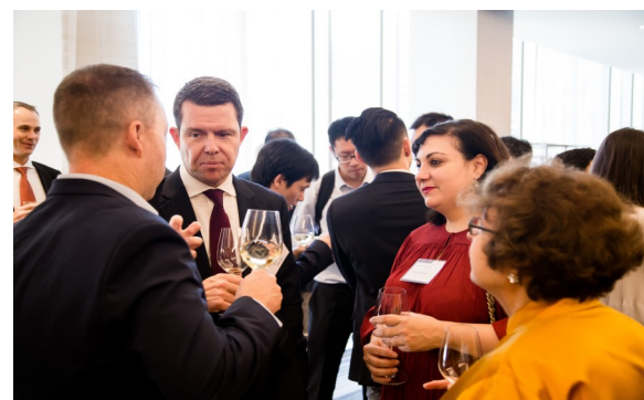
Alumni and friends connecting at the 9th Annual “From Graham to Buffett and Beyond” Dinner