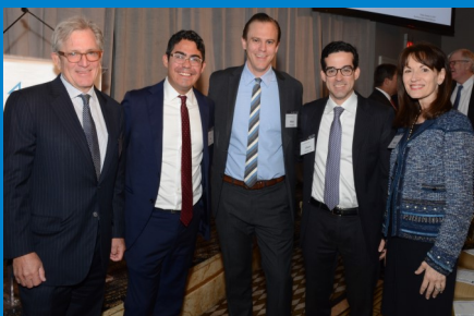
Alumni and friends reconnecting at the 27th Annual Graham & Dodd Breakfast