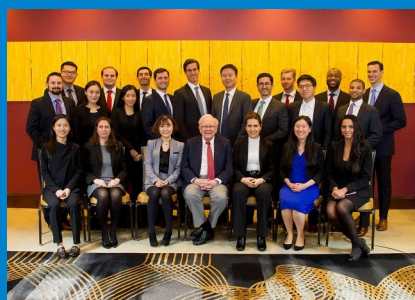
The class of 2018 students with Warren Buffett '51 in Omaha