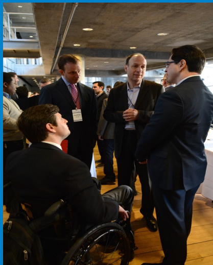
Alumni and friends discussing the expert insights shared at the 21st Annual CSIMA Conference