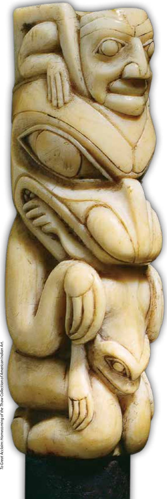
Dagger Hill, Haida, Queen Charlotte Islands, British Columbia; ca. 1800-1840; walrus ivory, iron band, later iron screw; 4" h. x 1" w. x 1.5" d. from the exhibition To Great Acclaim: Homecoming of the Thaw Collection of American Indian Art.