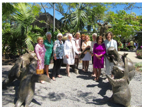
Circle of Friends at Naples Botanical Garden