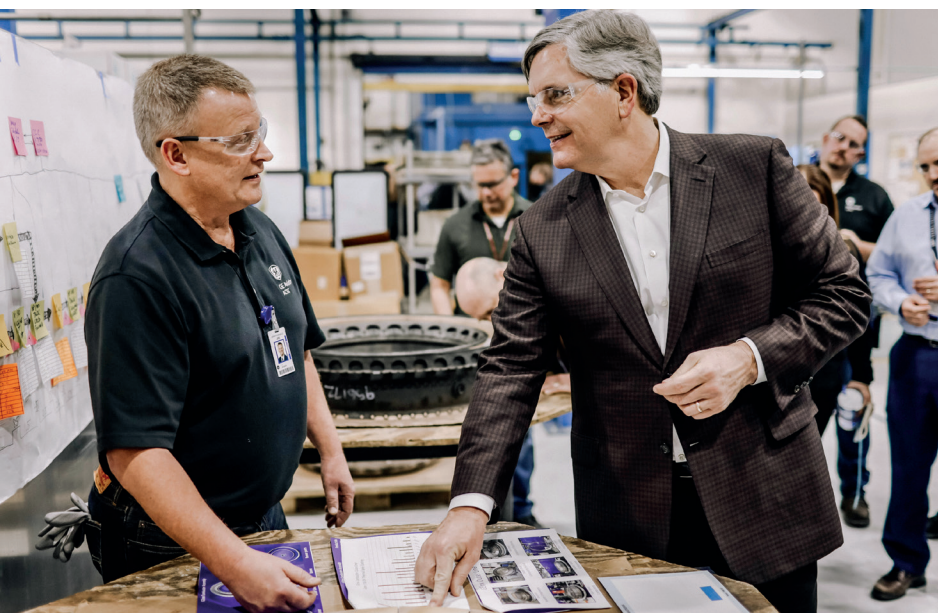
H. LAWRENCE CULP, JR. Chairman of the Board and Chief Executive Officer

One of the most urgent challenges I've heard from our customers is finding a way to build all of this while reducing their greenhouse gas emissions. Our leadership and Board are focused on this, too. Investing in efficient technology is an important part of the solution, and we've been working on this for decades—from building the world's most powerful offshore wind turbine and most efficient gas turbine, to creating jet engines that are significantly more fuel-efficient than their predecessors, to developing grid-scale energy storage and enabling combustion of carbon-free fuels like