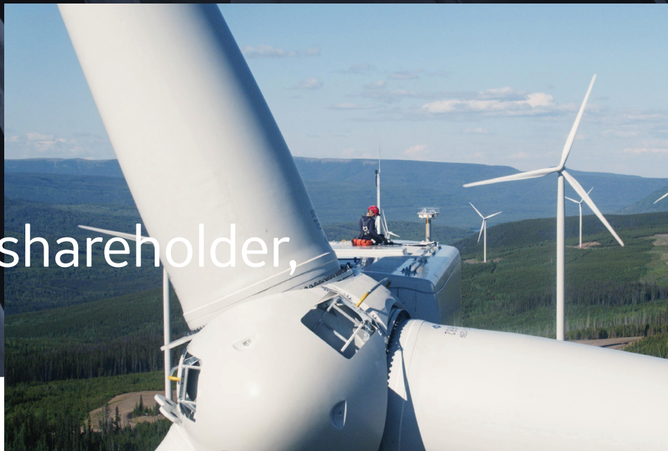
Over 60 GE wind turbines work together at Meikle Wind Farm, the largest wind farm in Western Canada, to generate enough energy to power over 54,000 homes in British Columbia. GE uses drones to safely inspect these turbines.

First, a sincere thank you for sharing your ideas and counsel over the last year. When I began as CEO, it was critical for me to listen, not just to replicate what's worked for me elsewhere. Your feedback is playing an important role in our efforts to make GE a stronger, more valuable company.