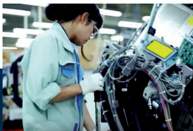
GE Healthcare's Hino factory has been applying lean for decades, now using software like GE Digital's Proficiency™ Operations Hub to digitally transform its operations. The site was recognized by the World Economic Forum in 2020 as one of the world's most advanced manufacturing sites.

Broadly, though, Renewable Energy's performance was mixed. I think about the dynamics at play in Renewable Energy in three parts. First, Onshore Wind is our most established, profitable business, and it is meeting high customer demand and growing internationally. Second, we're placing technology bets in fast-growing markets. In October, for example, Offshore Wind successfully installed the prototype for the Haliade™-X, which already is breaking records for power production by a wind turbine. Third are our required turnarounds in Grid Solutions and Hydro. Improving project underwriting and daily execution here will be a major focus for us in 2020.