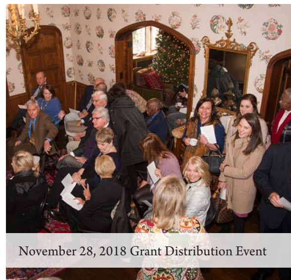
November 28, 2018 Grant Distribution Event