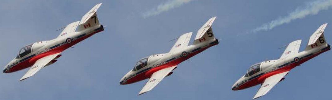
Air Show

American Heritage Forum Anderson International Festival Anderson Regional Air Show Anderson Swim Club Booster Club AnMed Community Health Improvement Brighter Christmas Fund Carroll "Frog" Reames Sculpture Fund Celebrate Anderson Clemson University Bone Marrowthon Dog Park Fund Go Play Outside Disc Golf Course Junior Leadership Anderson Junior Leadership Pickens County Leadership Anderson Class 33 Sign Project William R. Phillips Memorial St. Patrick's Day Breakfast TBA 100 William L. Watkins Unrestricted Fund