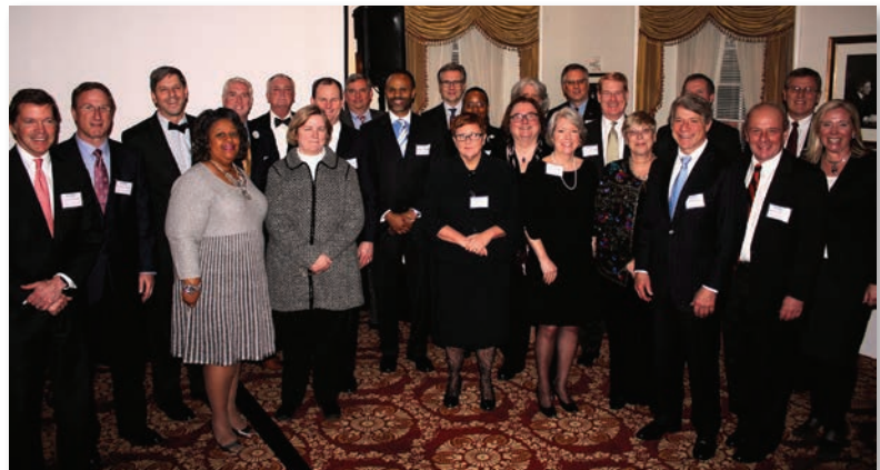
2017 Fellows Inductees