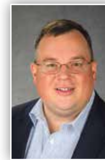
CHAD WEDDING MINING ENGINEERING