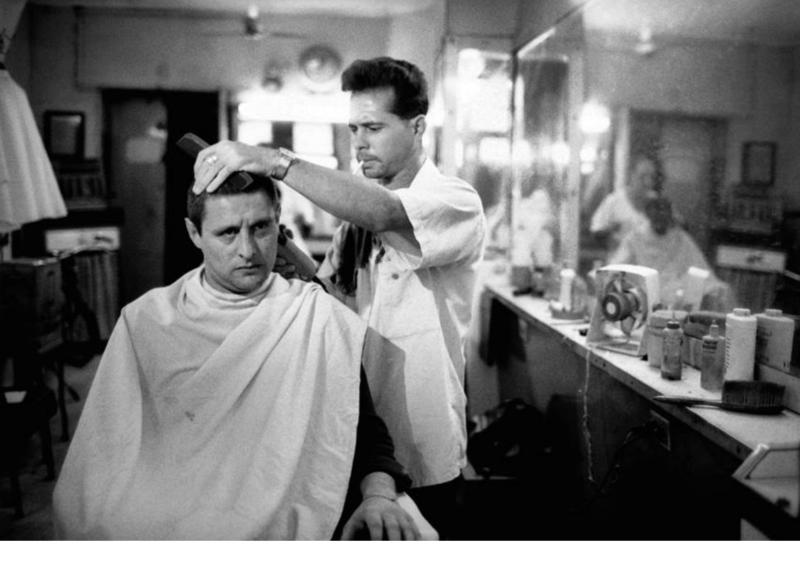
Shaun Ryder – Black Grape. Havana 1996.