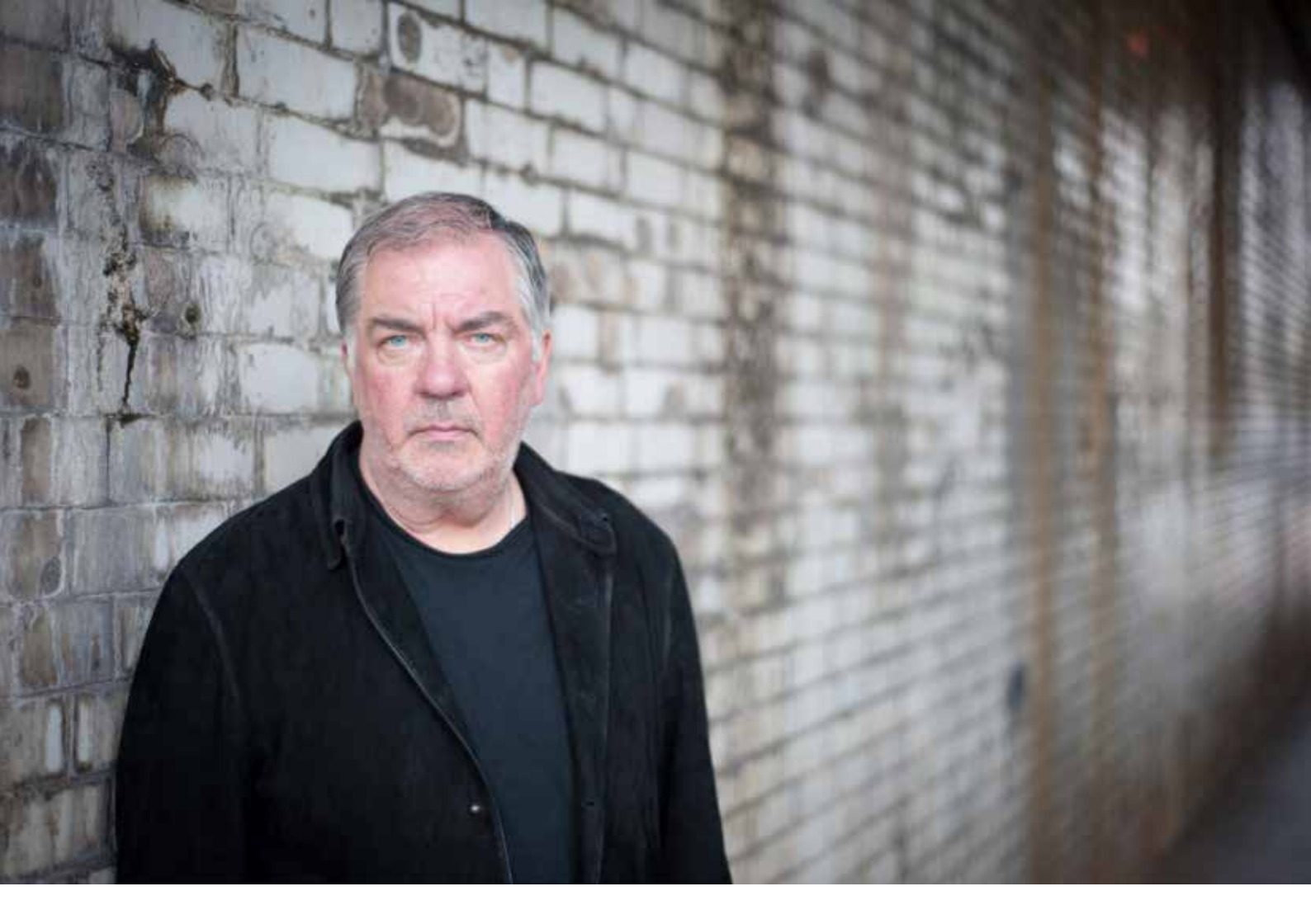
Kevin Cummins Photographer © Kevin Cummins 2015

"When you're freelance, you need all the support you can get. It's especially hard when you're young and starting out. Knowing there's somebody out there like DACS, who is prepared to work on your behalf is reassuring."