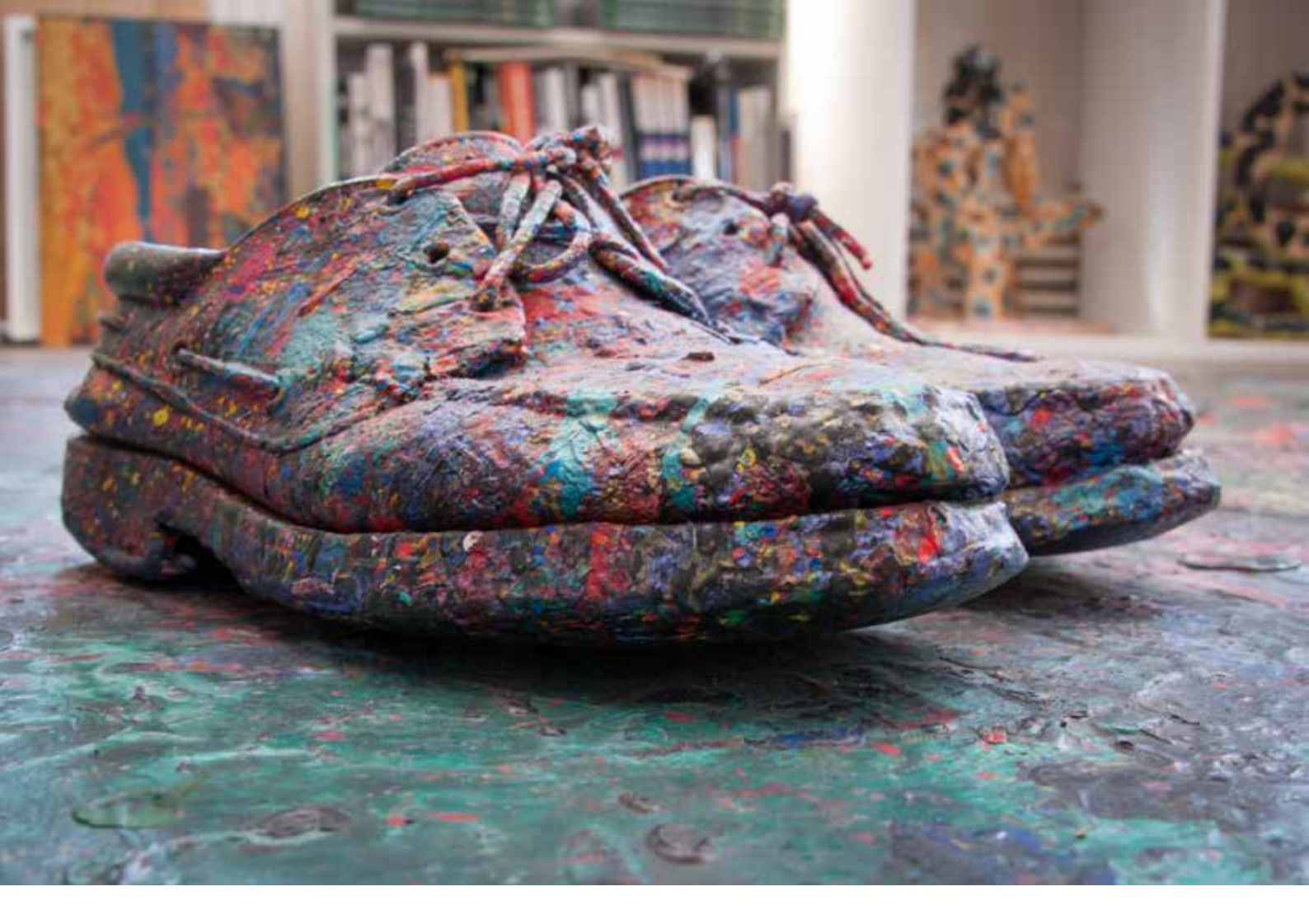
John Hoyland's studio