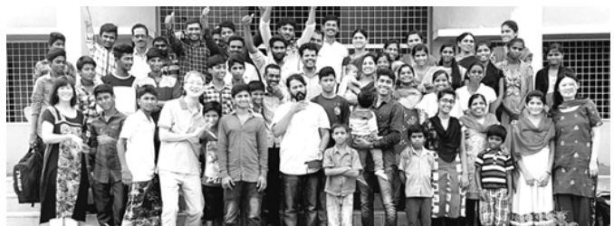
Group Photo taken at the end of the Camp