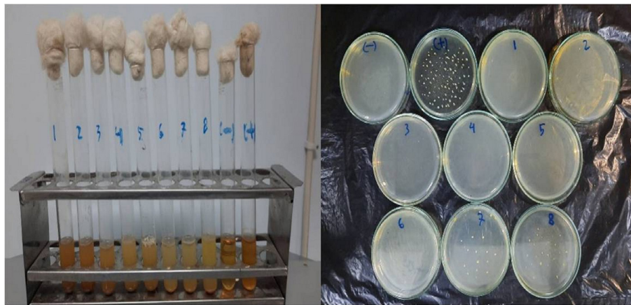
Figure 1: Growth inhibition of E. faecalis in Mueller-Hinton media induced Ambonese banana stem extract. Antimicrobial activity of each group at (-) negative control, (+) positive control, 1. concentration of 100%, 2. concentrations of 50%, 3. concentrations of 25%, 4. concentrations of 12.5%, 5. concentrations of 6.25%, 6. concentrations of 3.125%, 7. concentrations of 1.563%, 8. concentrations of 0.781%.

showed that at a concentration of 3.125% there was no growth of bacterial colonies. This shows that the administration of Ambonese banana stem extract with a concentration of 100-3.125% can inhibit bacterial growth, while the concentrations below that are 1.563% and 0.781% there is bacterial colonies growth of 13 colonies or 7.78% and 30 colonies or 17.9% (Table I).