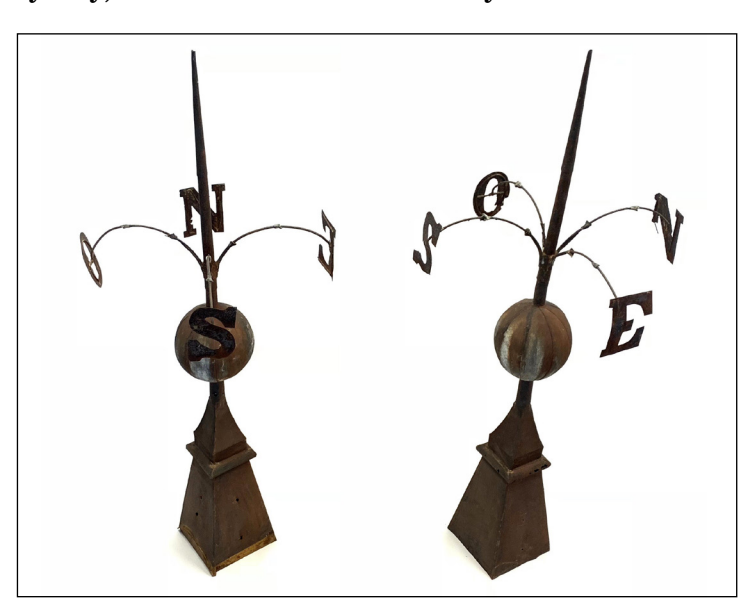
SOUTH ROAD ART & ANTIQUES, Stanfordville, N.Y. — Pair of Nineteenth Century French directional finials, steel, with wood supports, 51 inches high by 21 inches wide.