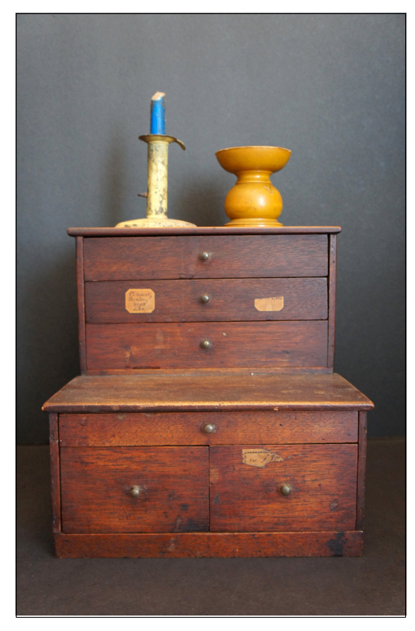
PAT HATCH ANTIQUES, Harvard, Mass. — Tabletop set of drawers, 11 by 11 by 11 inches, Shaker sander in chrome yellow paint and yellow tin candlestick with blue candle.

SOUTH ROAD ART & ANTIQUES, Stanfordville, N.Y. — Primitive game wheel, painted wood, 30½ inches wide by 35 inches high, from an amusement park in Pennsylvania, circa 1930.