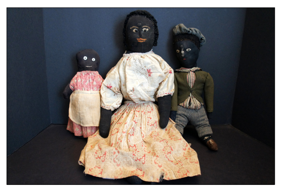
PAT HATCH ANTIQUES, Harvard, Mass. — Three black dolls, left to right: 10-inch-tall bottle doll; 22-inch-tall lovely lady; and 14-inch-tall man with very nice clothes.