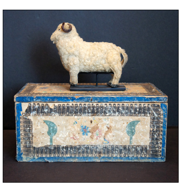
PAT HATCH ANTIQUES, Harvard, Mass. — Blue wallpaper covered wooden box measures 10\frac{1}{2} by 5\frac{1}{2} by 4\frac{1}{2} inches high, ram lamb zippered purse for child on professional stand 5\frac{1}{2} by 5 inches high.