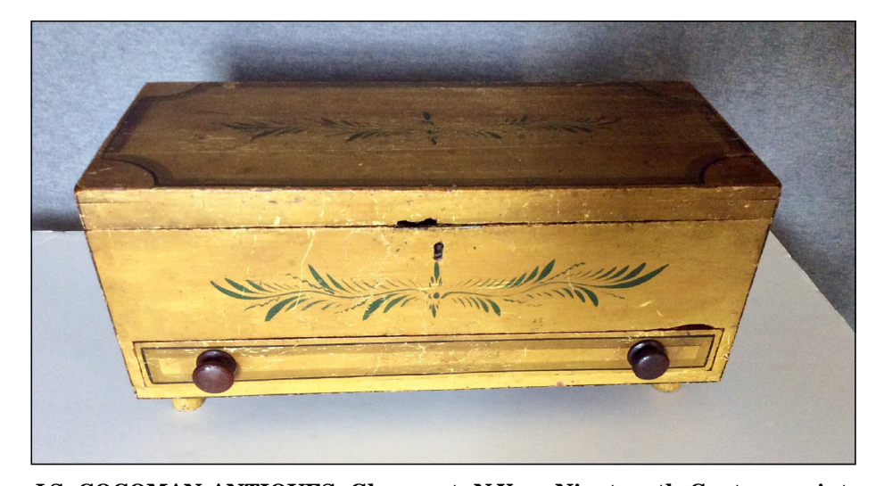
\ensuremath{\mathsf{J.S.}} COCOMAN ANTIQUES, Glenmont, N.Y. — Nineteenth Century paint-decorated dresser box with drawer.