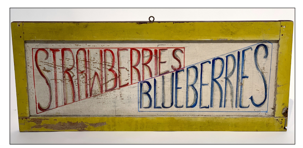
SOUTH ROAD ART & ANTIQUES, Stanfordville, N.Y. — Vintage fruit sign, painted wood, 31½ by 13 inches, American, Twentieth Century.

The Everett Arena is located at 15 Loudon Road in Concord, NH Directions from downtown manchester: Take I-93 to Exit 14. Go right on Loudon Rd/NH 9. Go less than a quarter mile and we are on the left.