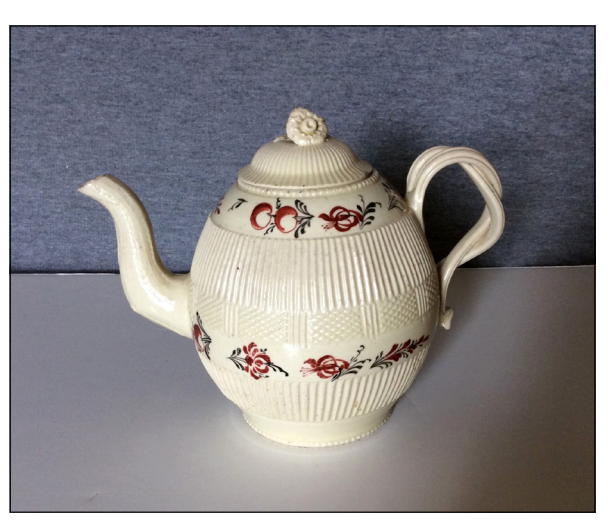
J.S. COCOMAN ANTIQUES, Glenmont, N.Y. — Eighteenth Century creamware teapot ex Donald Towner.

DAVID THOMPSON ANTIQUES & ART, South Dennis, Mass. — Boston side chair, 1730–50, possibly from the shop of John Leach, carved walnut with slip seat; height: 40½ inches, width: 22 inches, depth: 21½ inches. Acquired from a multigenerational New England estate.