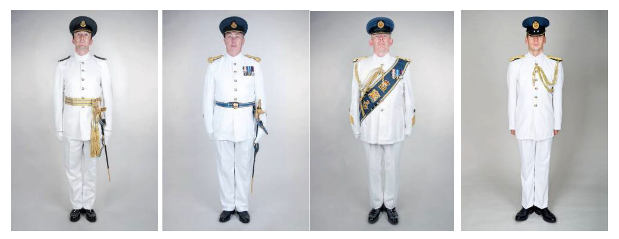
Director of Music