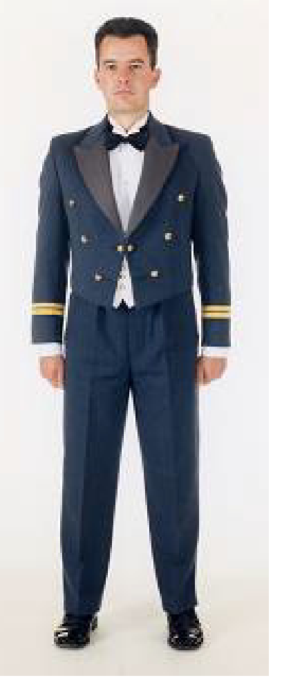
New Image Pending- white bowtie Officer No 5A