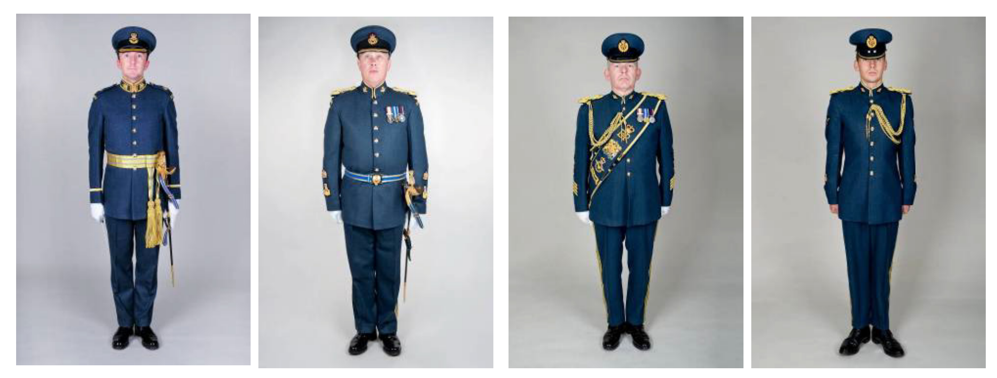
Director of Music