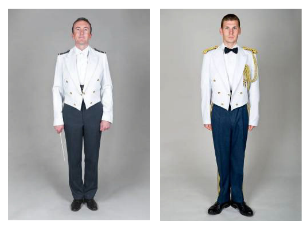
Director of Music