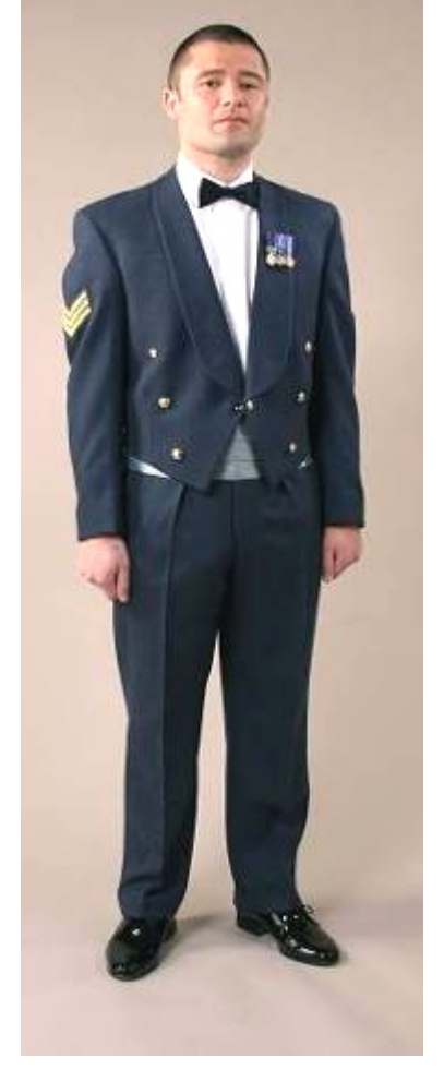
SNCO No 5