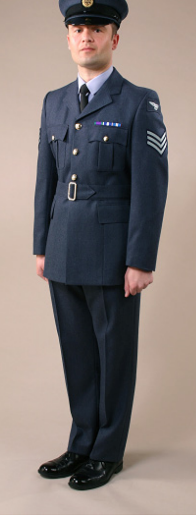
FS & Below