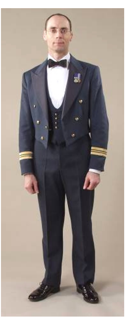
Officer No 5B