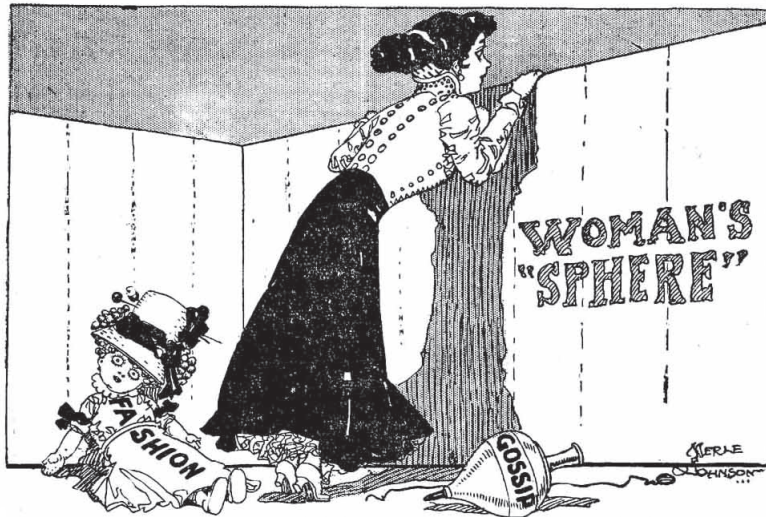
Woman Devotes Her Time to Gossip and Clothes Because She Has Nothing Else to Talk About. Give Her Broader Interests and She Will Cease to Be Vain and Frivolous.