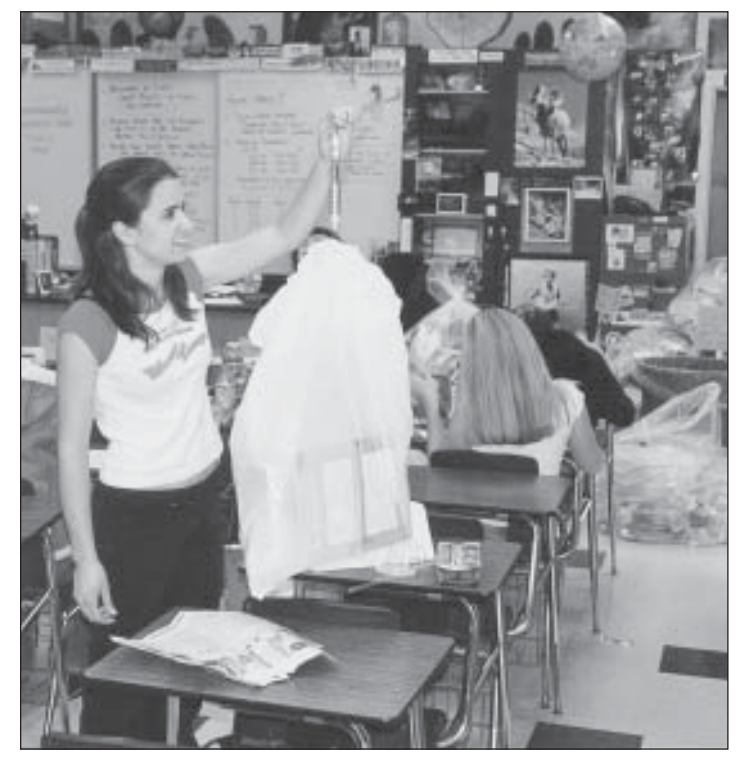
"We <u>are</u> the sum of our throughputs."