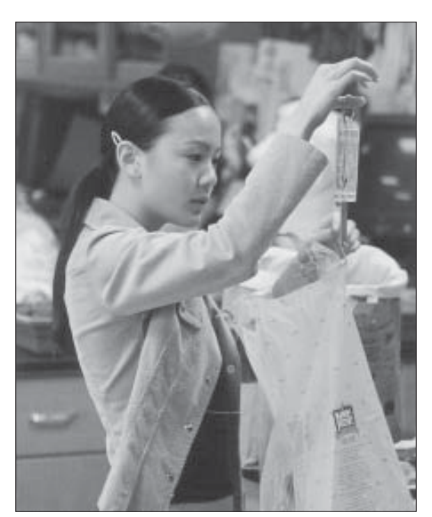
Weighing personal solid wastes accumulated during the seven-day assignment period.