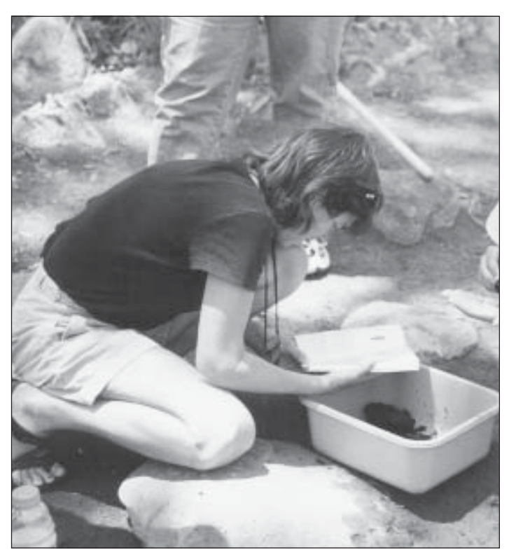
Examining aquatic invertebrates on the banks of the Animas River in Durango, Colorado.

AP Environmental Science at Palos Verdes High School is a two-semester course that examines a variety of natural science fields (e.g., environmental science, ecology, environmental studies, geology, chemistry, geography) and several social science disciplines (e.g., economics, politics, ethics). The course is designed to fully acquaint students with an understanding of the many topics and subject areas within the environmental science field and to provide them with many opportunities to apply their environmental science knowledge and understanding to their daily lives today and throughout their lives. The course is designed to promote environmental science literacy so that students will be better prepared to make decisions about issues that impact the environment, be it on a small or large scale. Additional course objectives include establishing and building in every student a sense of stewardship for the environment and illustrating, throughout the course, that one person can make a difference.