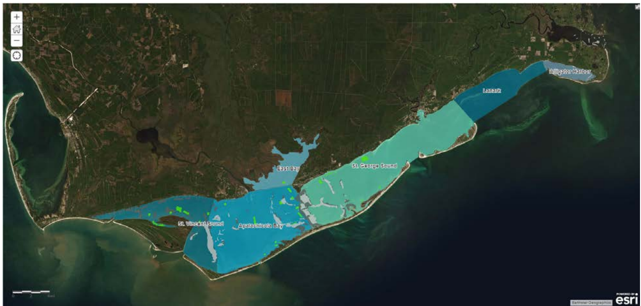
ABSI Project Area Map