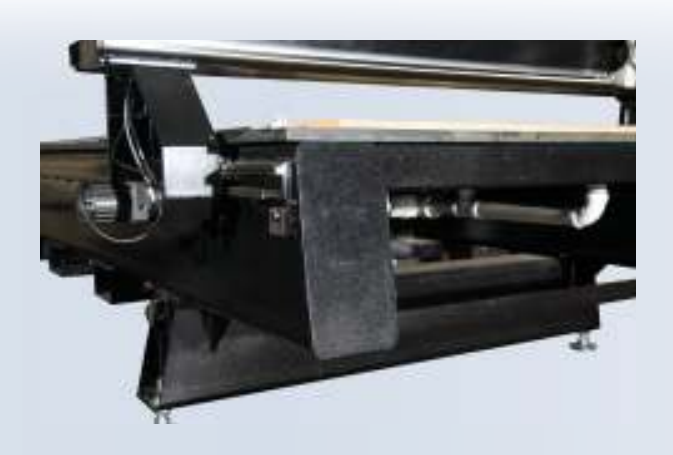
Base Frame Solid, Heavy-Duty Construction

The Apex's base is a rigid 3/8" thick tube frame that is welded, stress relieved and precision machined. It provides a heavy and accurate platform that translates into gentle motion for clean, smooth cuts.