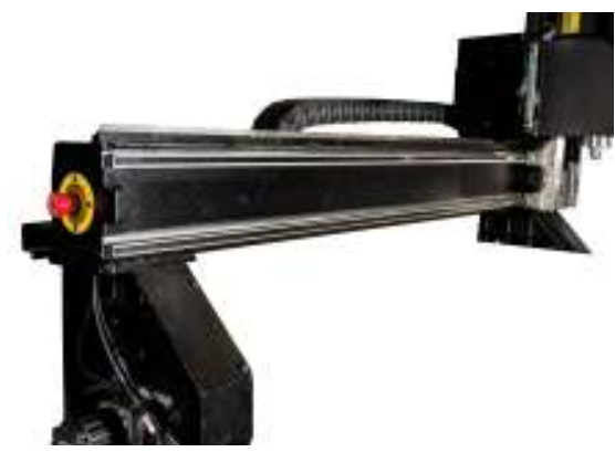
Gantry Custom Engineered for Maximum Rigidity Made of 3/8" thick steel tube, the gantry is welded, stress