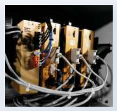
Digital Servo Drives Accurate & Reliable

The Apex3R offers a low cost alternative to automatic tool changing. It features a linear tool rack holder mounted at the end of the material process area.