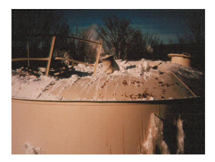
Tank Damaged by Vacuum in Combination with Snow Load