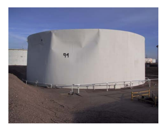
Tank Damaged by Negative Internal Pressure (Vacuum)