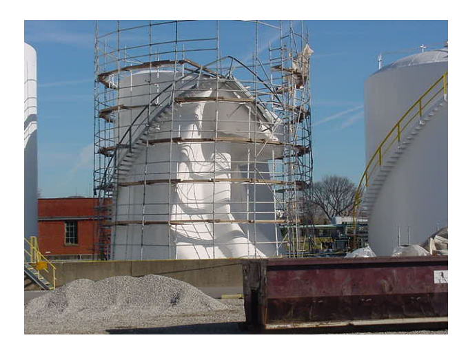
Tank Damaged Beyond Repair by Vacuum