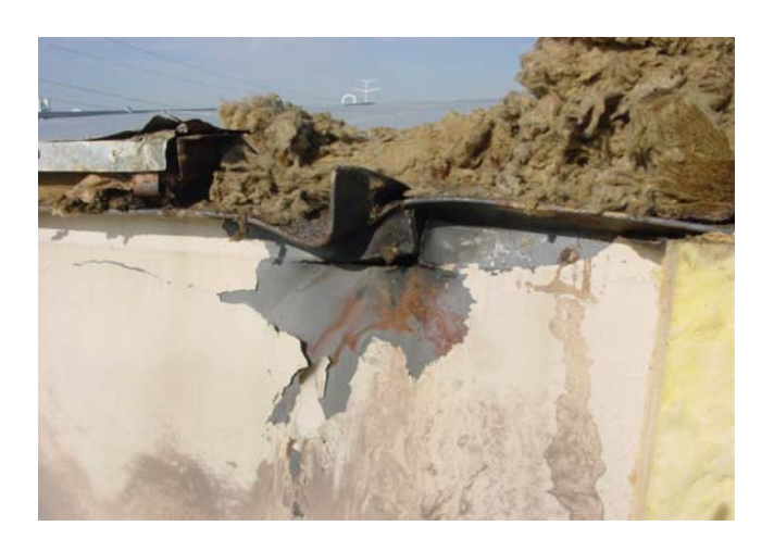
Tank Roof to Shell Connection Damaged by Vacuum