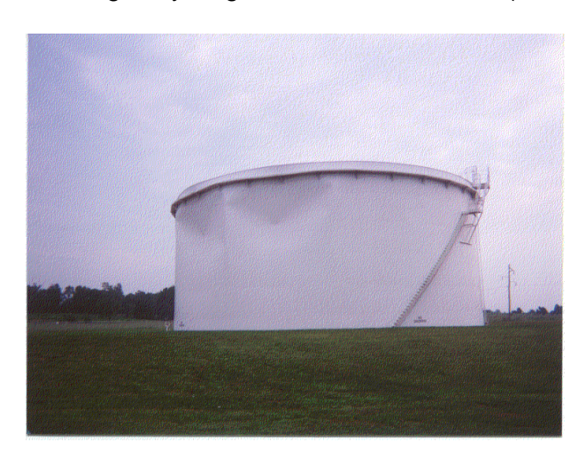
Tank Damaged by Tornado Winds