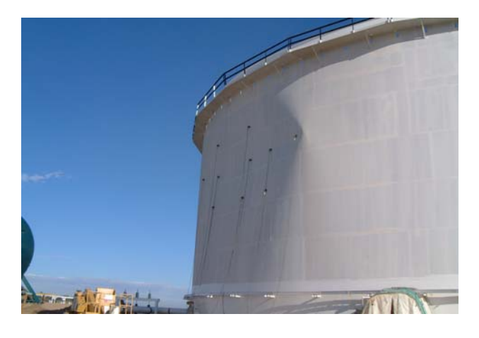
Tank Damaged by Wind (Before Pulling Out Dents)