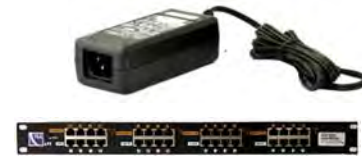
Power supplies & Power Injectors