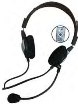
TEMPEST & Privacy headsets with & w/o PTT to minimize risk of conversation eavesdropping.