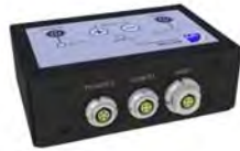
DAT-602 TEMPEST POSITIVE DISCONNECT SWITCH