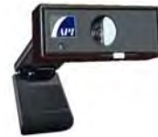
DAT-604 TEMPEST WEBCAM