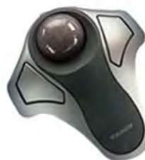
TEMPEST TRACKBALL MOUSE