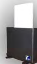
TEMPEST SMART CARD