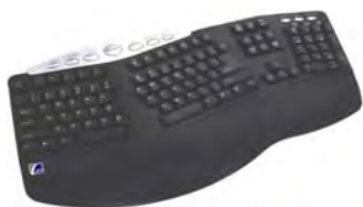
TEMPEST ERGO KEYBOARD