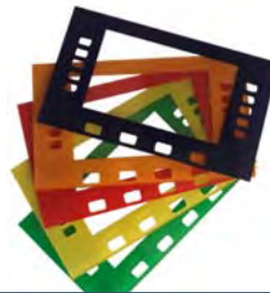
Colored Bezels as visual cues to eliminate domain confusion