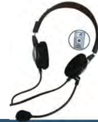
AL1-185 TEMPEST HEADSET (push-to-talk)