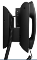
Phone & KEM Wall Mounts