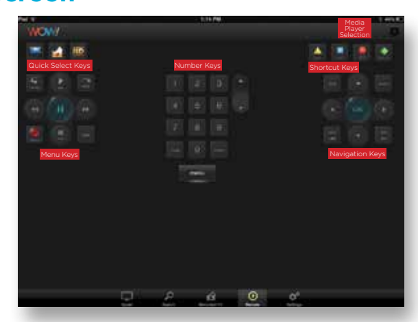
NOTE - The remote screen can only be used while your device is connected to the wireless network from your WOW! Internet service.

The Remote screen allows you to use your device as a remote control for your WOW! ULTRA<sup>SM</sup> Media Players.