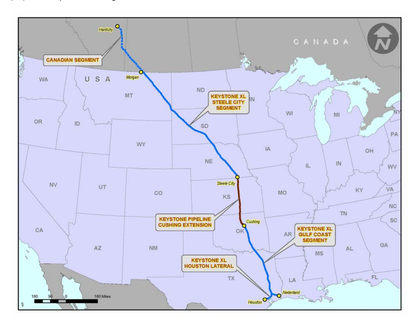
Figure A-1 Overview of the Project

TransCanada Keystone Pipeline, LP (Keystone) proposes to construct and operate a new crude oil pipeline and related facilities from Hardisty, Alberta, Canada to the Port Arthur and east Houston areas of Texas in the United States (US). The project, known as the Keystone XL Pipeline Project (Project), will have a nominal capacity to deliver up to 900,000 barrels per day of crude oil from an oil supply hub near Hardisty, Alberta to existing terminals in Nederland near Port Arthur, Texas, and the Moore Junction in Houston, Texas. See the proposed Project route in Figure A-1 .