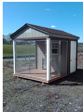
Fox Run Sheds 399 Route 31 South Washington, NJ 07822 908-689-7999 info@foxrunsheds.com http://www.foxrunsheds.com/