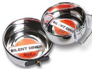
Coop cups King Wholesale Pet Supplies 4013 Colusa Hwy Yuba City, CA 95993 1-800-825-4647 https://kingwholesale.com/?s=coop+cups