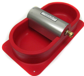
Reservoir waterer Lion Country Supply P.O. Box 480 Port Matilda, PA 16870 1-800-662-5202 https://www.lcsupply.com/Poly-Double-Reservoir-Dog-Waterer/productinfo/PDRW/