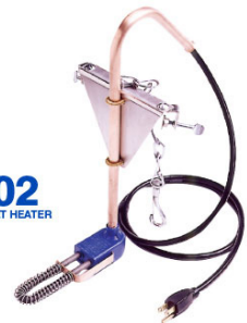
Water bucket heater Nelson Manufacturing Company 3049 12th Street .W. Cedar Rapids, IO 52406 1-888-844-6606 https://www.nelsonmfg.com/dog-water-bucket-heaters/10202/