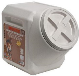
Gamma Vittles Vault Gamma2 Airtight Pet Food Containers service@gamma2.net http://www.gamma2.net/