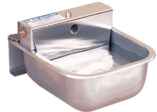
Automatic dog waterer Nelson Manufacturing Company 3049 12th Street .W. Cedar Rapids, IO 52406 1-888-844-6606 https://www.nelsonmfg.com/dog-waterers/1200/