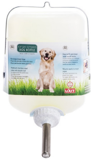
Water bottle system Lixit Animal Care Products http://www.lixit.com/