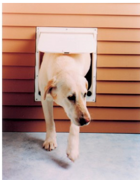
Magnador Dog Doors for Doors & Kennels 202 Tank Farm Road, Suite F1 San Luis Obispo, California 93401 sales@petdoors.com https://www.petdoors.com/

Examples of how to provide outdoor access: