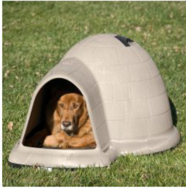
Indigo dog house