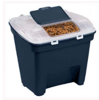
Bergen Smart Storage Coastal Pet Products, Inc. 911 Leadway Ave Alliance, OH 44601 800-321-0248 http://www.coastalpet.com/products/product/bfs01.aspx