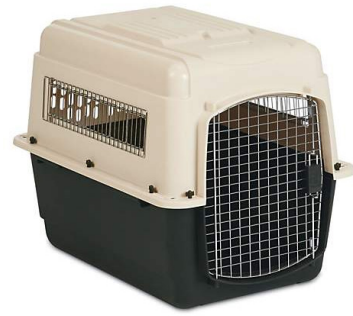
Pet Mate Vari-Kennel https://www.petco.com/shop/en/petcostore/product/petmate-ultra-vari-dog-kennel