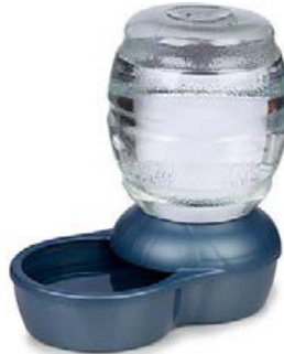
Auto watering system Petmate PO Box 1246 Arlington TX 76004 https://www.petmate.com/petmate-replendish-waterer-with-microban/product/24486