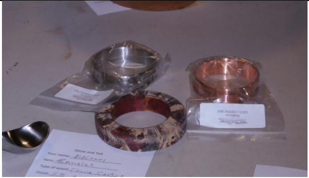
Don Maloney - bangles, cholla cactus, copper and stainless steel inserts