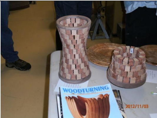
Scott Schlosser - open segmented form, bubinga & white oak, (not yet finished), demo of easy segmented template