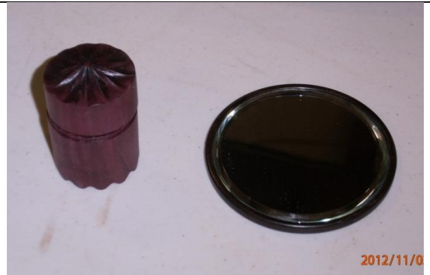
Ken Darr – Turned mirror and threaded box. Ken used a homemade Rose Engine to create beautiful decoration on them