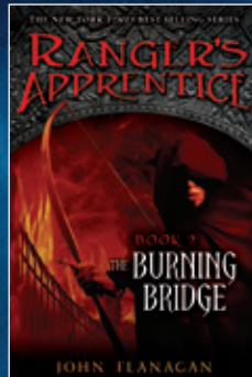
Book 2: The Burning Bridge HC: 978-0-399-24455-1 PB: 978-0-14-240842-1 Ages 10 up • Grades 5 up