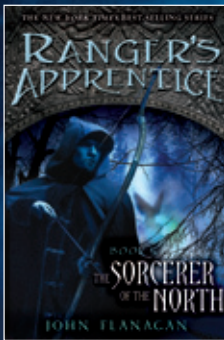
Book 5: The Sorcerer of the North HC: 978-0-399-25032-3 PB: 978-0-14-241429-3 Ages 10 up • Grades 5 up