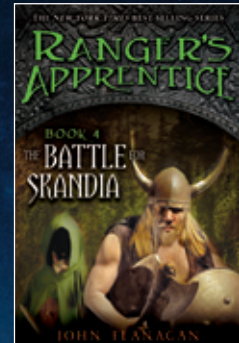
Book 4: The Battle for Skandia HC: 978-0-399-24457-5 PB: 978-0-14-241340-1 Ages 10 up • Grades 5 up