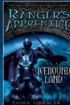
Book 3: The Icebound Land HC: 978-0-399-24456-8 PB: 978-0-14-241075-2 Ages 10 up • Grades 5 up