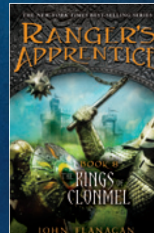
Book 8: The Kings of Clonmel HC: 978-0-399-25206-8 Audio: 978-0-14-24-242850-4 Ages 10 up • Grades 5 up