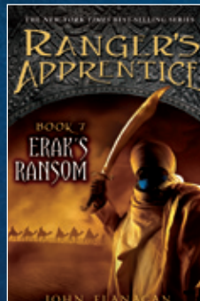
Book 7: Erak's Ransom HC: 978-0-399-25205-1 Ages 10 up • Grades 5 up