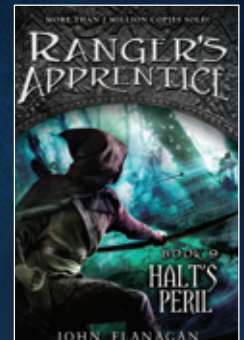
Book 9: Halt's Peril HC: 978-0-399-25207-5 Audio: 978-0-14-242851-1 Ages 10 up • Grades 5 up

COMING SPRING 2011! Book #10: The Emperor of Nihon-Ja • HC: 978-0-399-25500-7 • Audio: 978-0-14-242896-2