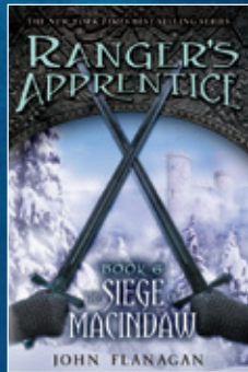
Book 6: The Siege of Macindaw HC: 978-0-399-25033-0 PB: 978-0-14-241524-5 Ages 10 up • Grades 5 up