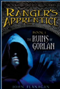
Book 1: The Ruins of Gorlan HC: 978-0-399-24454-4 PB: 978-0-14-240663-2 Ages 10 up • Grades 5 up