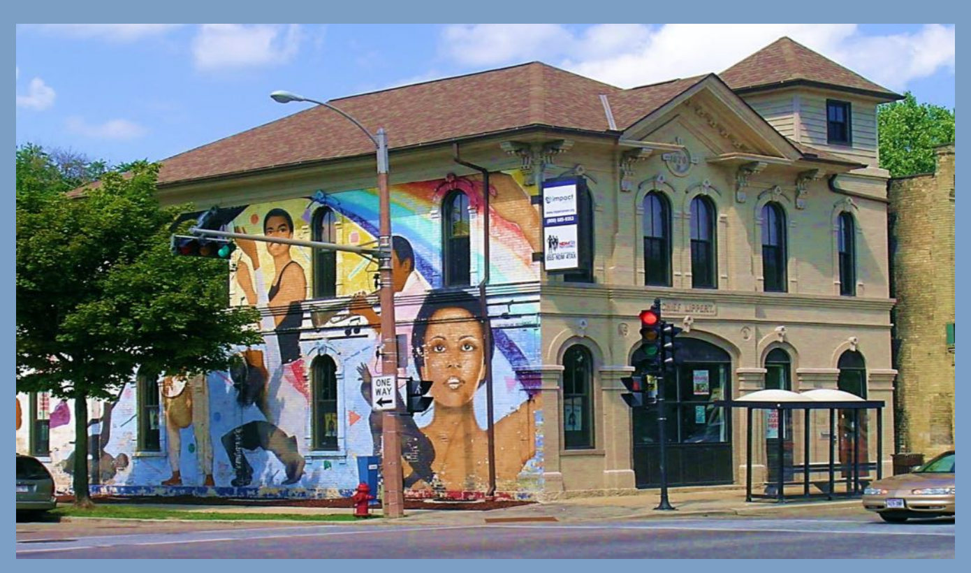
Todays neighborhood-Recently rehabbed Inner City Arts Council building