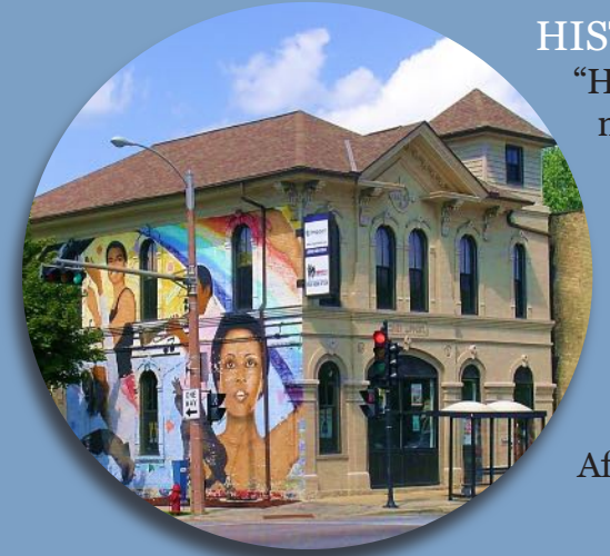
Todays neighborhood-Recently rehabbed Inner City Arts Council building

The Germans dominated the area that is today's Harambee through the 1920s. But other populations were pushing into the area, mainly from the Lower East Side, which included Poles, Italians, and Puerto Ricans, particularly after World War II. Some Eastern European Jews opened shops along the business corridors in the neighborhood.