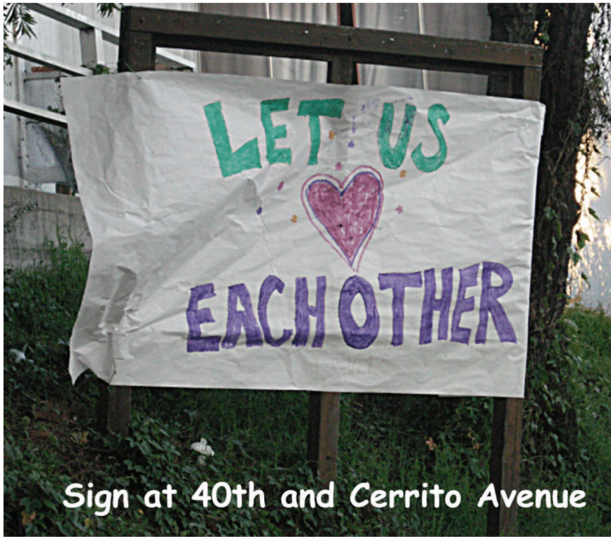
Sign at 40th and Cerrito Avenue