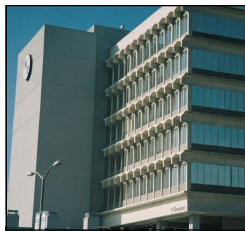
Concrete floor girders extend beyond the glass "curtain" wall, forming a honeycomb pattern with interesting shadows. Architect Irving Shapiro won an award for the innovative design in 1965.

The atrium of the mall contained a 600-seat International Food Bazaar designed to serve up to 4,000 hungry patrons a day. Even the food bazaar's mechanical dishwasher was