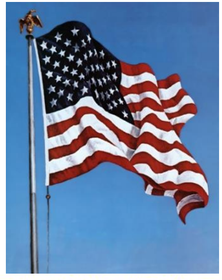
The Official Publication of the 4th Degree, Knights of Columbus, of North Carolina

Veterans Day, November 11 Thanksgiving Day, (fourth Thursday in November) National Pearl Harbor Remembrance Day, December 7 (half-staff all day) Christmas Day, December 25