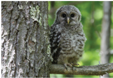
Barred Owlet out of nest, Brookline, NH, May 2015

As our winter fades into spring, some birds are already nesting and preparing for the arrival of newly hatched fledglings. These birds are several species of owls; the two earliest nesters being Barred