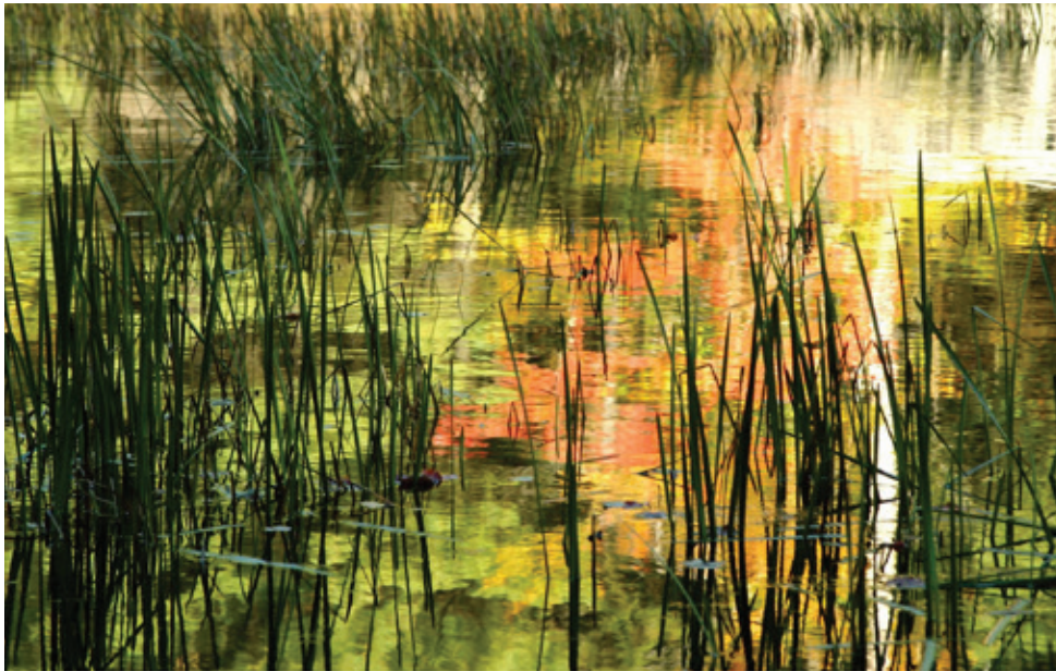
"Hancock Reflections" by Hal Close will be one of his many photographs on exhibit.