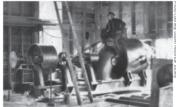
Charles Appleton's son "Arthur on the new wheel" circa 1907 when the new plant (Dublin Elec. Co.) was built replacing the former building.

Within a year, 24 streetlights were added and the town's churches were wired. Private customers joined the queue and there was simply not enough power. The solution? Raise the dam by two feet and run 1465 feet of pipe, three-and-a-half feet in diameter, from the old dam, downstream to a new powerhouse. This added 50 feet of drop and a tremendous increase in pressure. Every section of that big pipe, and the large turbines, had to be hauled here