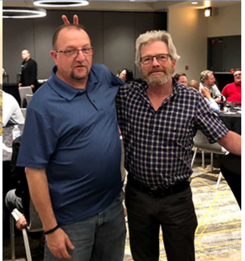
Spring 2020 IFMA AIRFC Council Meeting Houston, TX