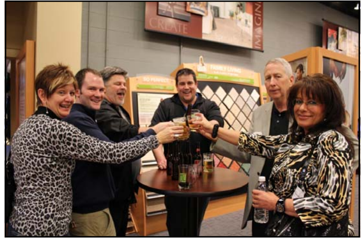
HBA Members enjoying the networking!!