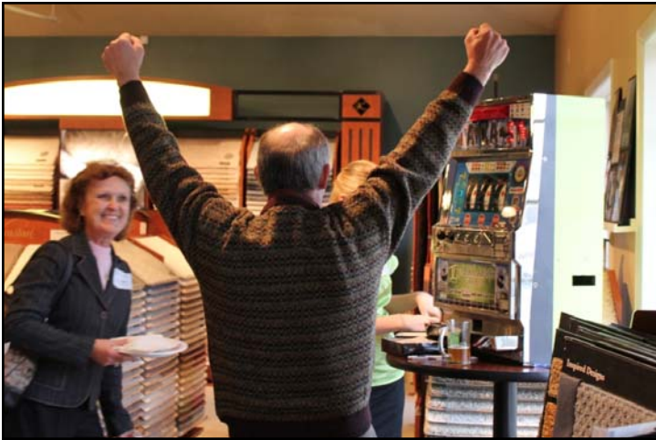
Congratulations to those who were big winners on the Jack Laurie Jackpot Slot Machine!! For those who weren't, better luck next time.