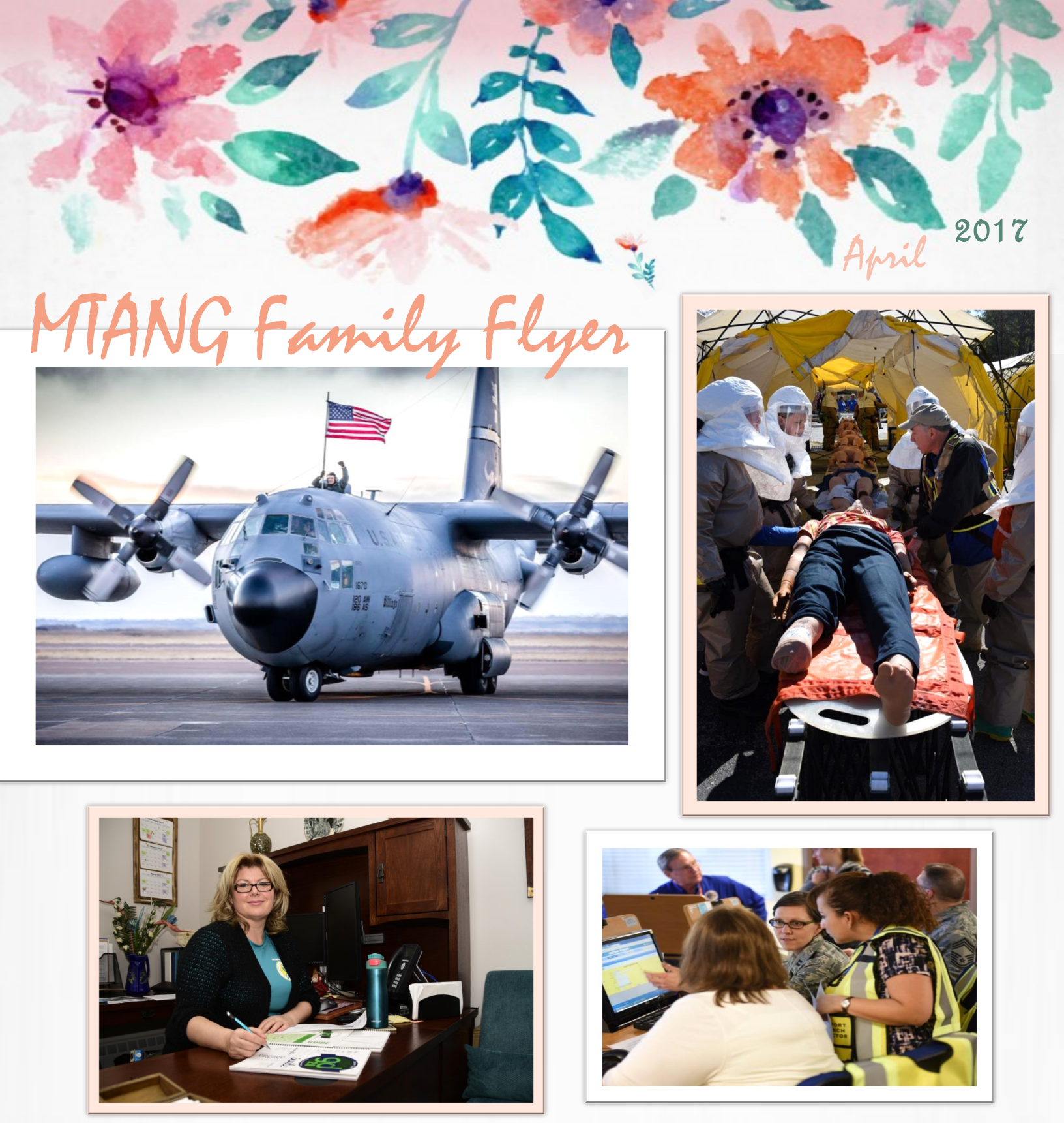
This announcement is provided for the benefit of members of the National Guard.

It is intended for informational purposes only and does not constitute an endorsement by the Montana Air National Guard, the state of Montana or the United States Armed Forces. Any participation is solely the responsibility of the individual.