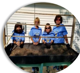
Ohio Edison UW@W Volunteers