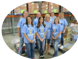
Seven Seventeen Credit Union UW@W Volunteers