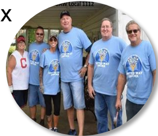
General Motors UW@W Volunteers

Congratulations to General Motors on being our top workplace campaign of 2017. General Motors continues to be one of United Way of Trumbull County's largest supporters. The organization's ongoing compassion and involvement with our various targeted impact events such as United Way @ Work, allows their organization to carry out their corporate social responsibility and build morale within their workplace. We thank them for strengthening our community, creating opportunities and continuing to partner with us year after year.