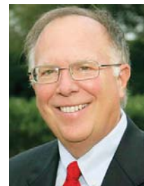
Rep. Todd Hunter

Longtime TPBC ally Rep. Todd Hunter of Corpus Christi filed HB 1455. Hunter also authored successful TPBC audit reforms in the 2009 and 2013 sessions.