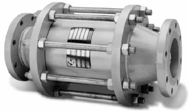
Figure 1. 8 Series High Pressure Deflagration Flame Arrestor